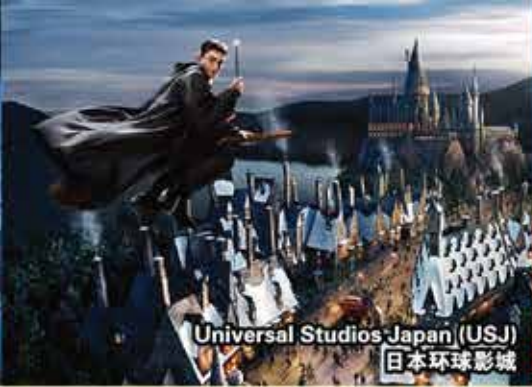
Universal Studios Japan (USJ) 日本环球影城