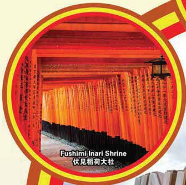
Fushimi Inari Shrine 伏见稻荷大社