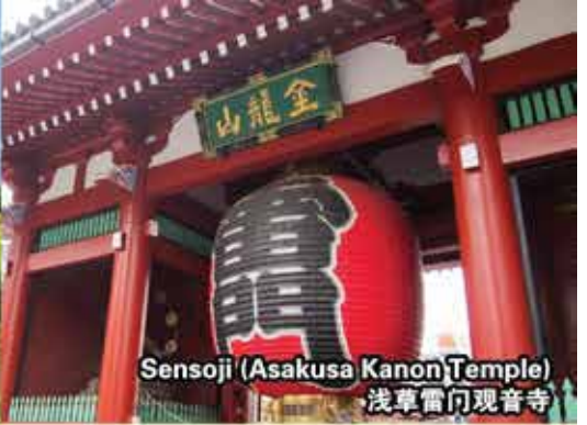
Sensoji (Asakusa Kannon Temple) 浅草雷门观音寺