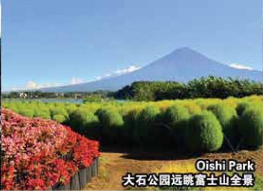
Oishi Park 大石公园远眺富士山全景