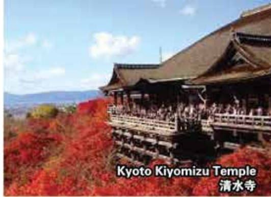
Kyoto Kiyomizu Temple 清水寺