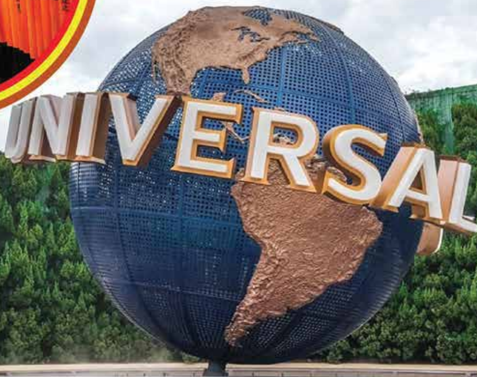
Universal Studios Japan (USJ) 日本环球影城

行程次序，以当地旅社安排为准。 Sequences of Itinerary are subject to local arrangement.