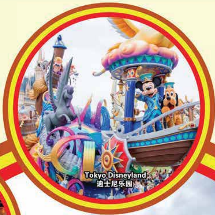
Tokyo Disneyland 迪士尼乐园