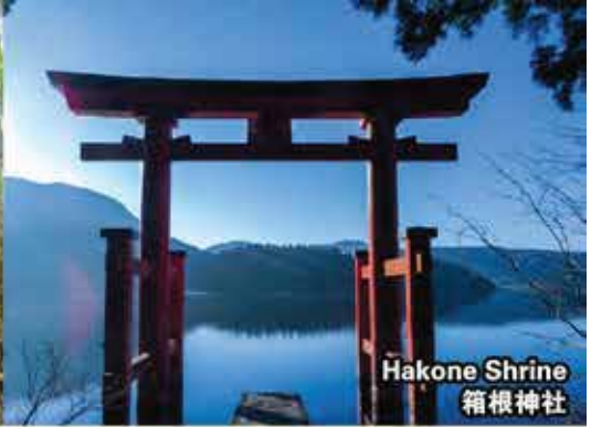
Hakone Shrine 箱根神社