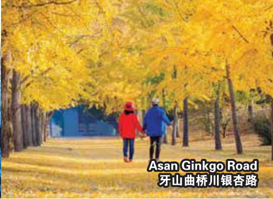
Asan Ginkgo Road 牙山曲桥川银杏路