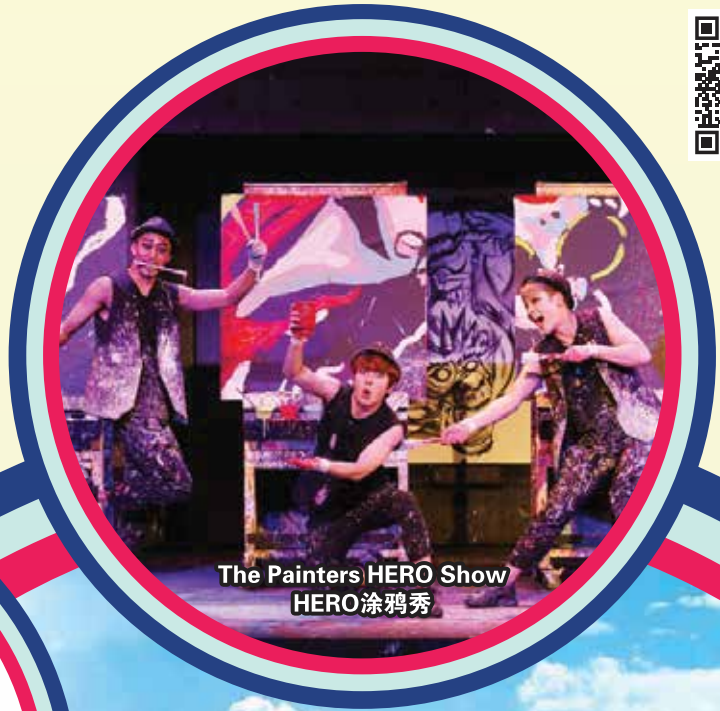
The Painters HERO Show HERO 涂鸦秀