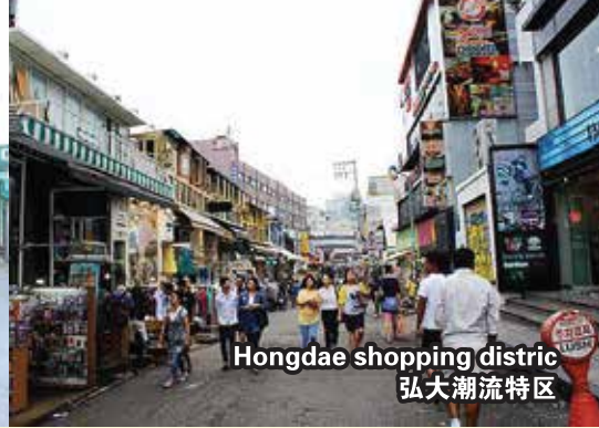
Hongdae shopping district 弘大潮流特区