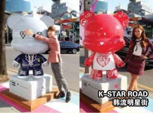
K-STAR ROAD 韩流明星街