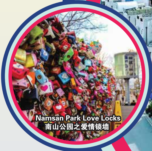
Namsan Park Love Locks 南山公园之爱情锁墙