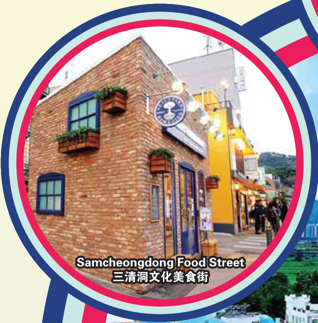
Samcheongdong Food Street 三清洞文化美食街