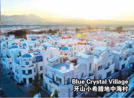
Blue Crystal Village 牙山小希腊地中海村