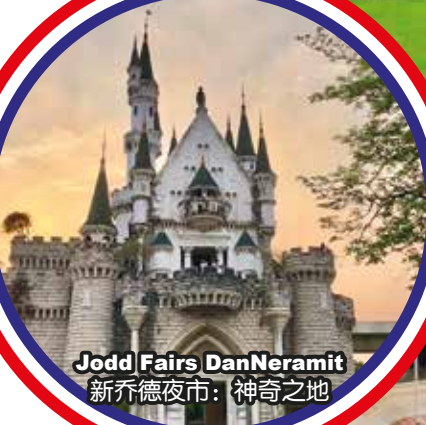
Jodd Fairs DanNeremit 新乔德夜市：神奇之地