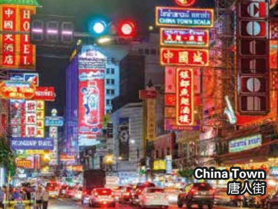
China Town 唐人街