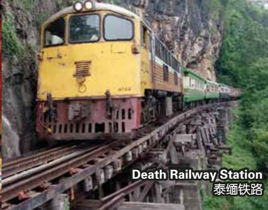
Death Railway Station 泰緬鐵路