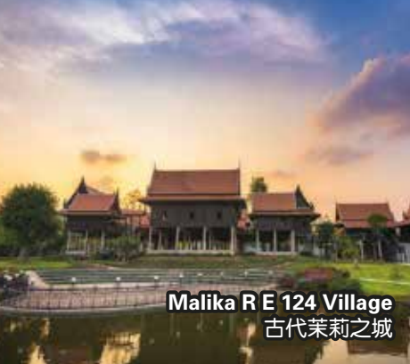
Malika R E 124 Village 古代茉莉之城