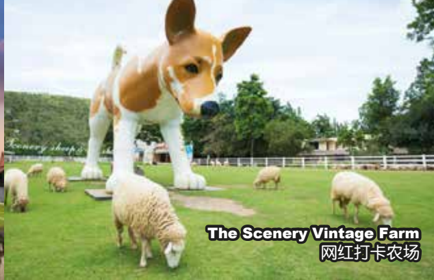
The Scenery Vintage Farm 网红打卡农场