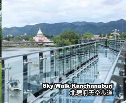
Sky Walk Kanchanaburi 北碧府天空步道