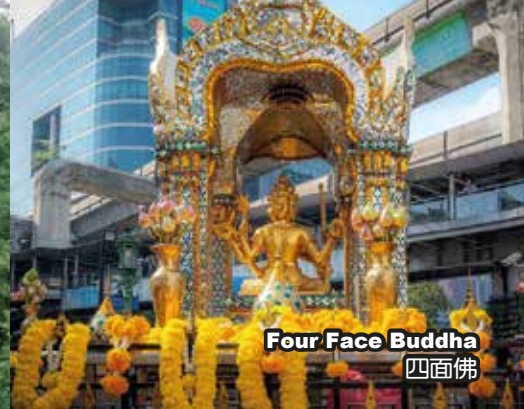
Four Face Buddha 四面佛