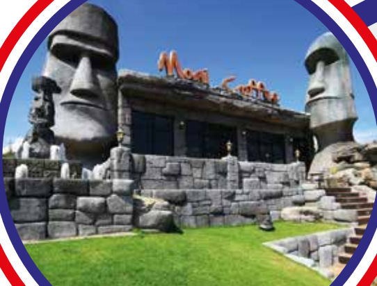
Moai Coffee Suan Phueng 巨人咖啡