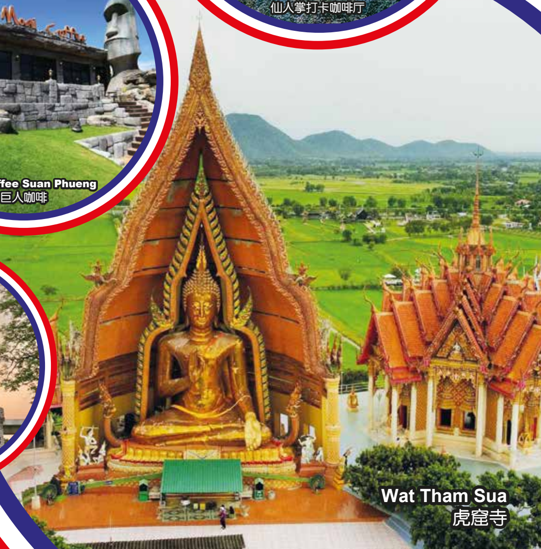
Wat Tham Sua 虎窟寺

行程次序，以当地旅社安排为准。 Sequences of Itinerary are subject to local arrangement.