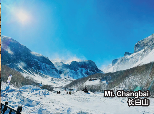
Mt. Changbai 长白山