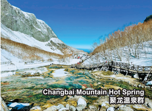
Changbai Mountain Hot Spring 聚龙温泉群