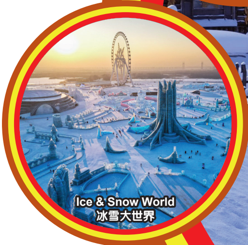
Ice & Snow World 冰雪大世界

行程次序，以当地旅社安排为准。 Sequences of Itinerary are subject to local arrangement.