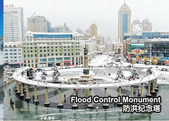
Flood Control Monument 防洪纪念塔