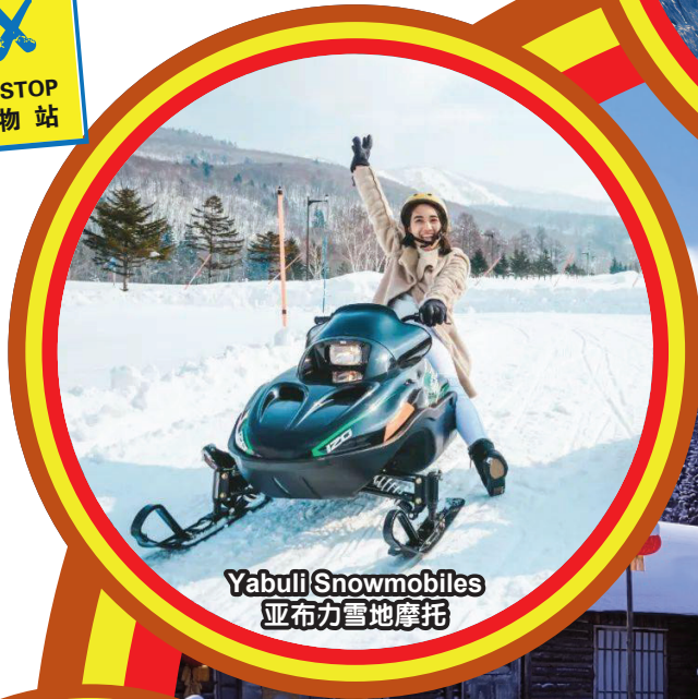
Yabuli Snowmobiles 亚布力雪地摩托