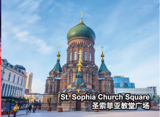
St. Sophia Church Square 圣索菲亚教堂广场