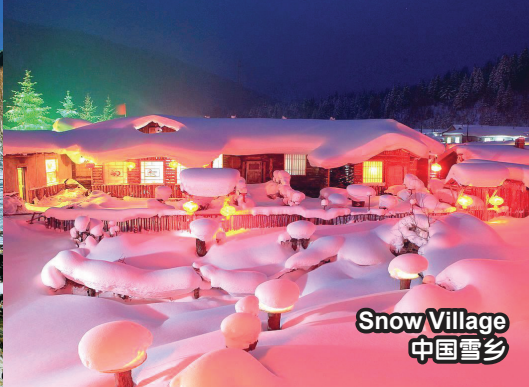
Snow Village 中国雪乡