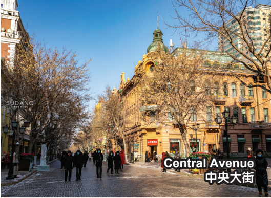
Central Avenue 中央大街