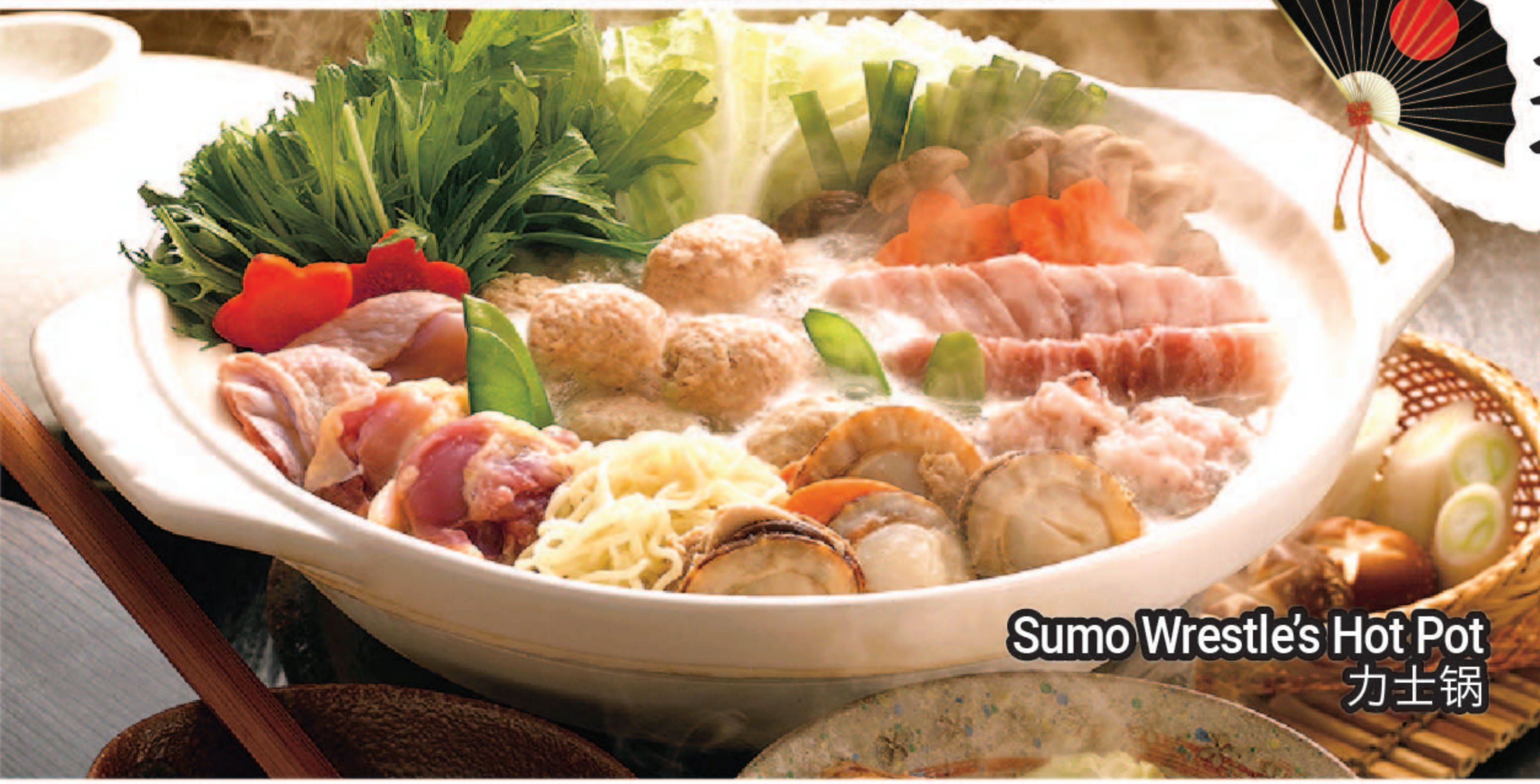
Sumo Wrestle's Hot Pot 力士锅