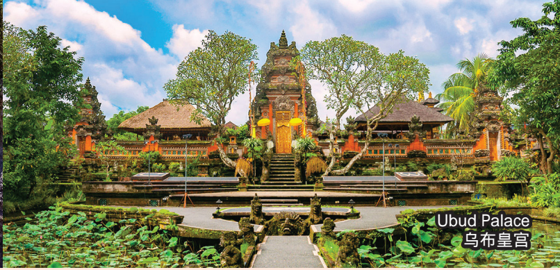
Ubud Palace 乌布皇宫