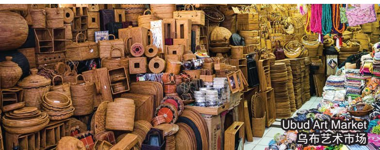
Ubud Art Market 乌布艺术市场