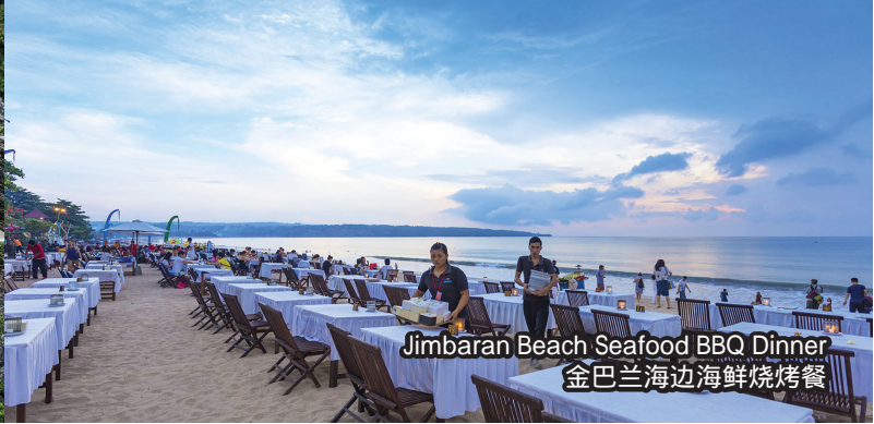
Jimbaran Beach Seafood BBQ Dinner 金巴兰海边海鲜烧烤餐