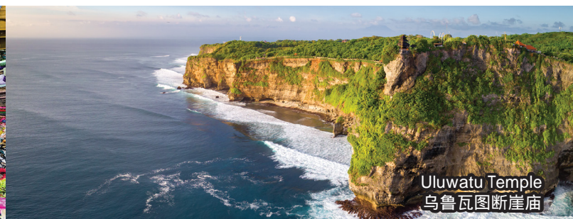
Uluwatu Temple 乌鲁瓦图断崖庙

Disclaimer: Due to Covid-19 travel restrictions, local / religious festivals, public holidays, weather condition, transport technical issue, acts of nature, Golden Destinations reserved the right to alter the sequence or change, amend or alter the itinerary if necessary, with or without prior notice.