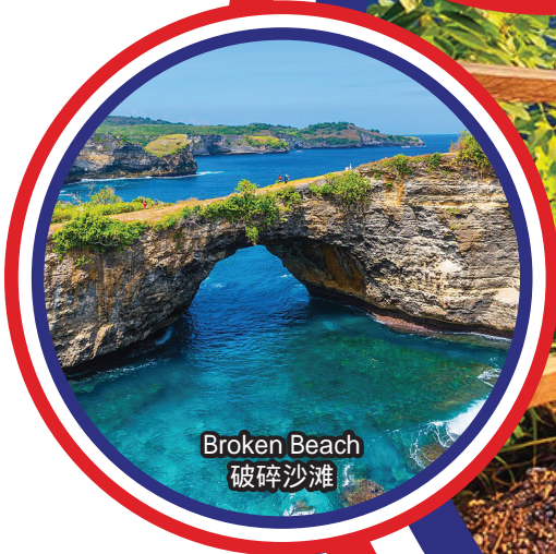
Broken Beach 破碎沙滩

行程次序，以当地旅社安排为准。 Sequences of Itinerary are subject to local arrangement.