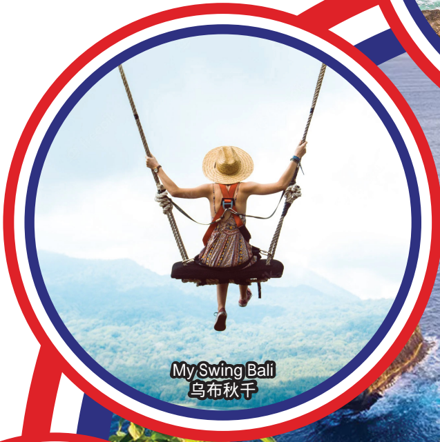
My Swing Bali 乌布秋千