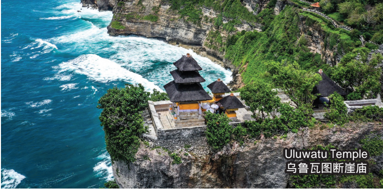
Uluwatu Temple 乌鲁瓦图断崖庙