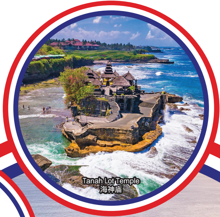
Tanah Lot Temple 海神庙