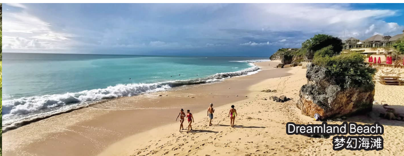
Dreamland Beach 梦幻海滩

免责声明:由于新冠肺炎疫情旅行限制当地/宗教节日,公众假期,天气状况,交通等情况,自然灾害,必要时黄金旅程保留对行程进行适当调整(调整景点游览顺序)以确保行程顺利进行,会或事先通知。