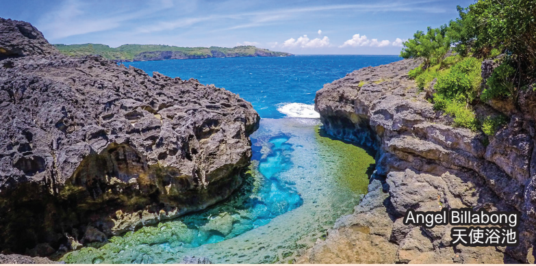
Angel Billabong 天使浴池