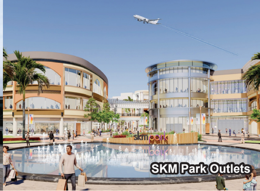
SKM Park Outlets