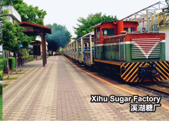
Xihu Sugar Factory 溪湖糖厂