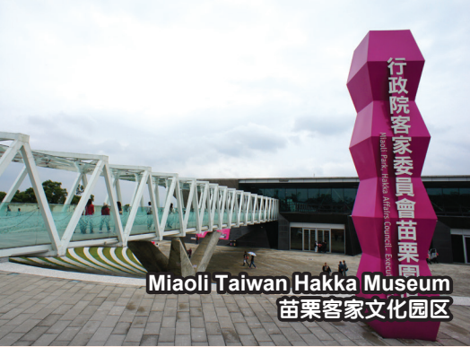
Miaoli Taiwan Hakka Museum 苗栗客家文化园区