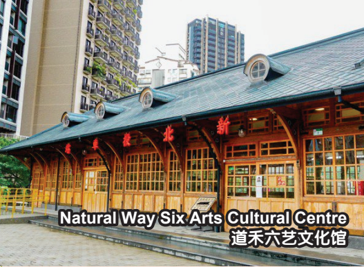
Natural Way Six Arts Cultural Centre 道禾六艺文化馆