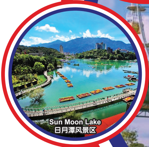
Sun Moon Lake 日月潭风景区