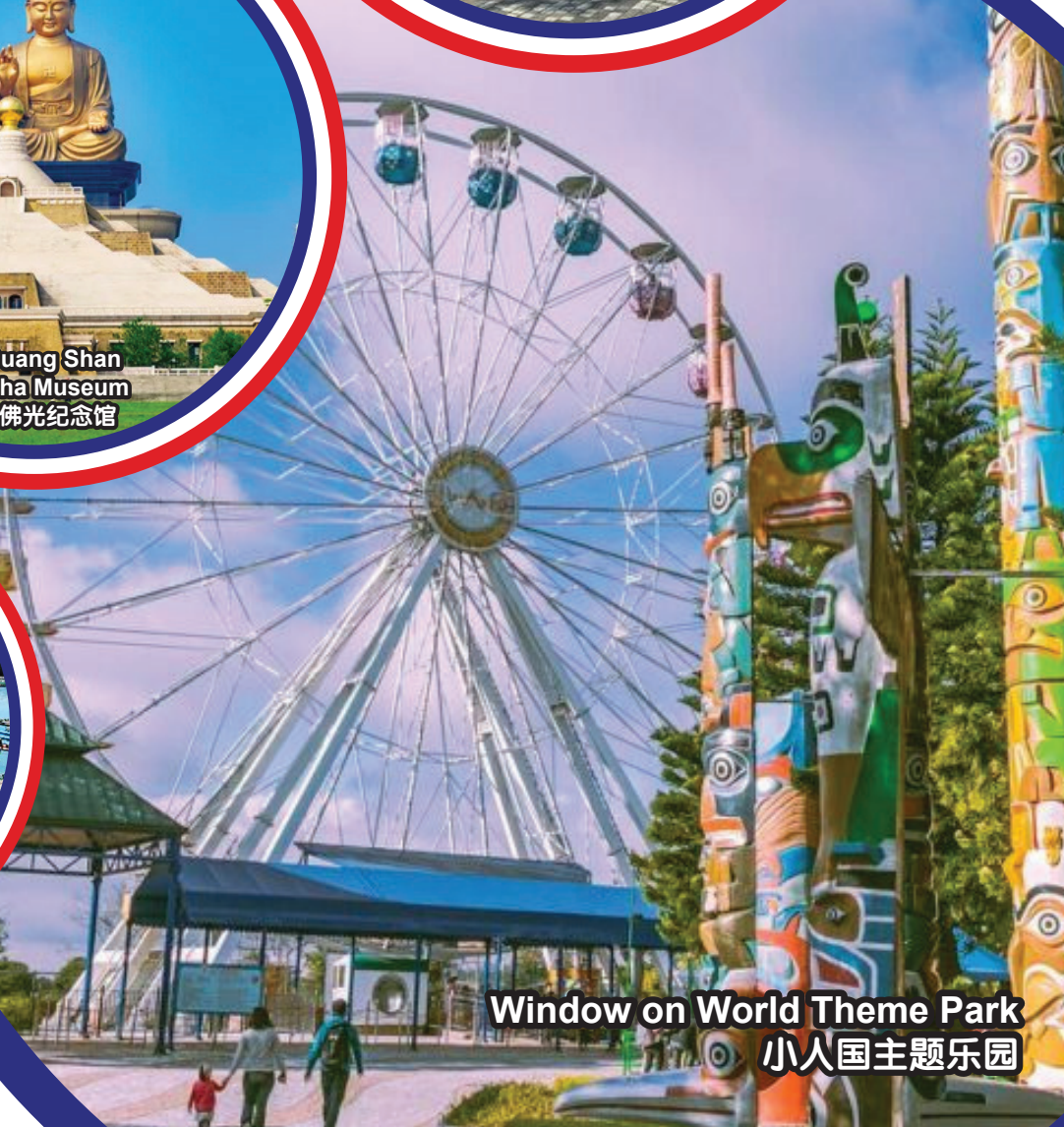
Window on World Theme Park 小人国主题乐园

行程次序，以当地旅社安排为准。 Sequences of Itinerary are subject to local arrangement.