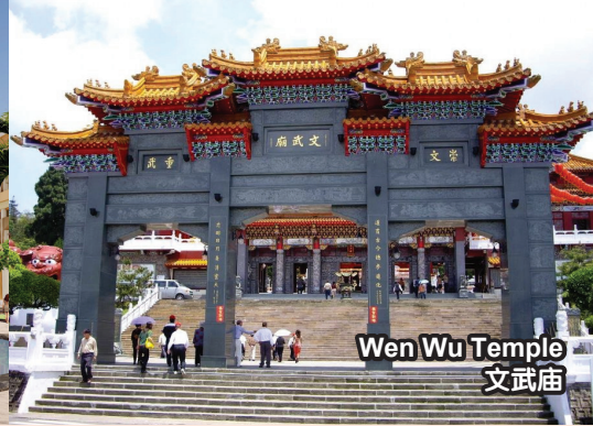
Wen Wu Temple 文武庙