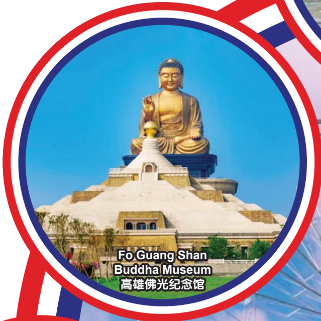
Fo Guang Shan Buddha Museum 高雄佛光纪念馆