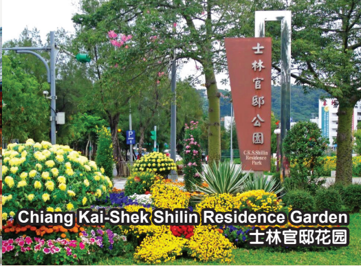
Chiang Kai-Shek Shilin Residence Garden 士林官邸花园