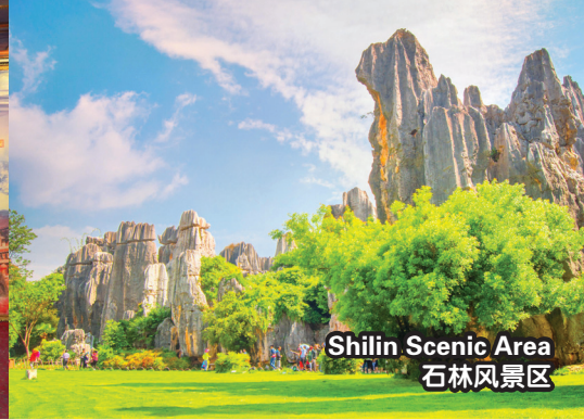
Shilin Scenic Area 石林风景区