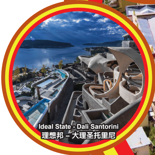
Ideal State - Dali Santorini 理想邦 - 大理圣托里尼

行程次序，以当地旅社安排为准。 Sequences of Itinerary are subject to local arrangement.