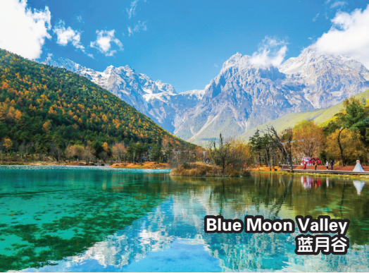
Blue Moon Valley 蓝月谷