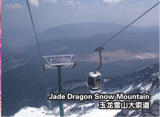
Jade Dragon Snow Mountain 玉龙雪山大索道