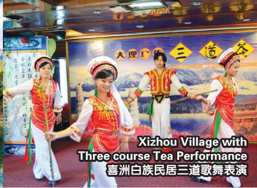
Xizhou Village with Three course Tea Performance 喜洲白族民居三道歌舞表演