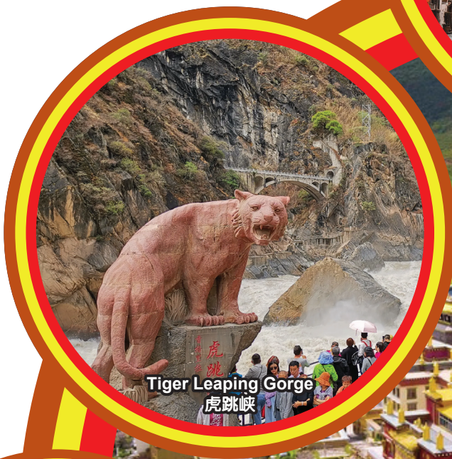
Tiger Leaping Gorge 虎跳峡