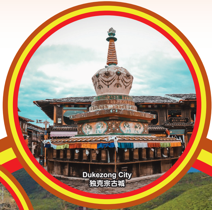
Dukezong City 独克宗古城