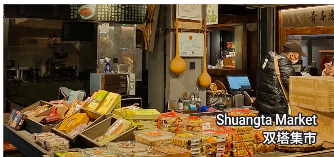
Shuangta Market 双塔集市