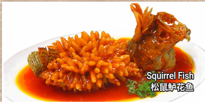
Squirrel Fish 松鼠鲈鱼