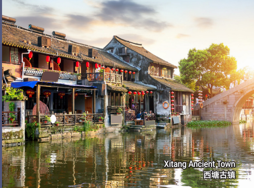
Xitang Ancient Town 西塘古镇