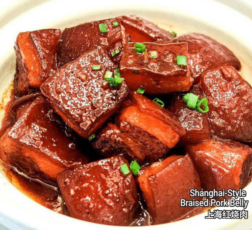
Shanghai-Style Braised Pork Belly 上海红烧肉