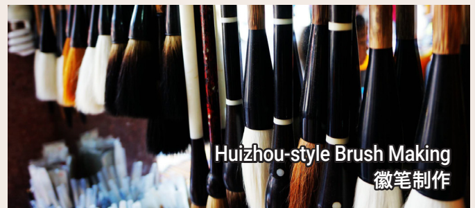
Huizhou-style Brush Making 徽笔制作