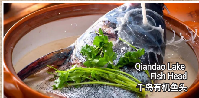
Qiandao Lake Fish Head 千岛有机鱼头