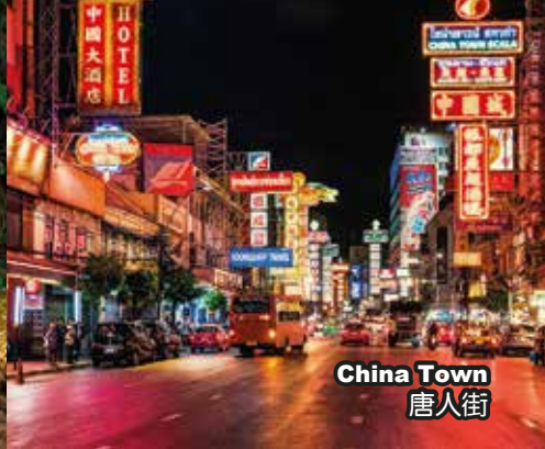
China Town 唐人街