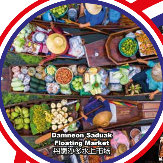
Damneon Saduak Floating Market 丹嫩沙多水上市场