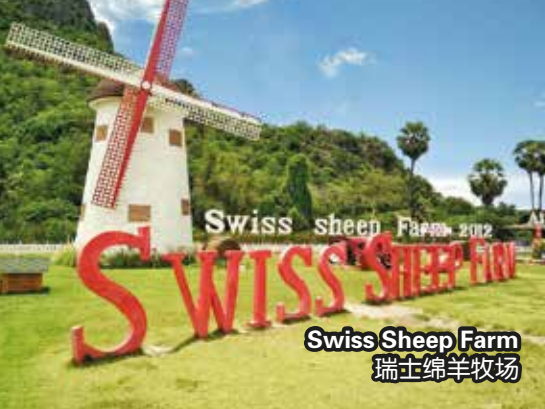
Swiss Sheep Farm 瑞士绵羊牧场