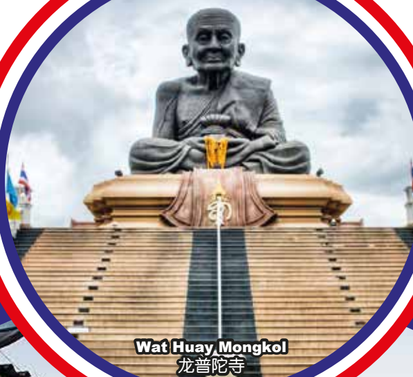
Wat Huay Mongkol 龙普陀寺