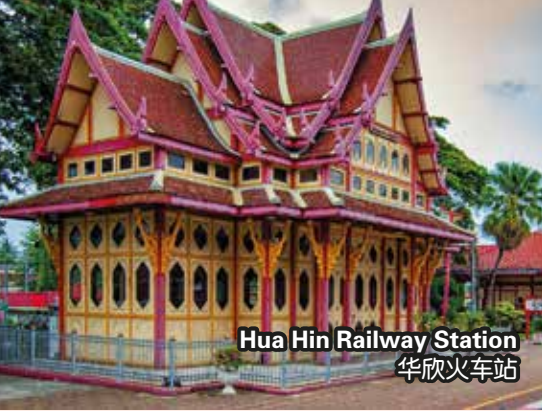
Hua Hin Railway Station 华欣火车站