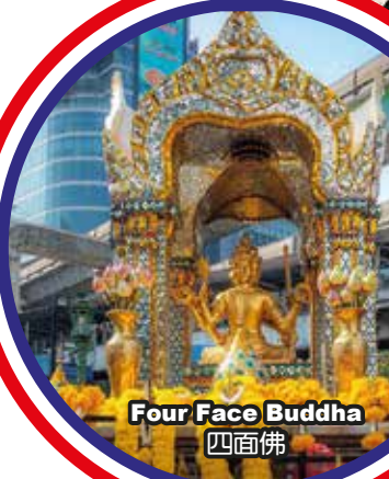
Four Face Buddha 四面佛