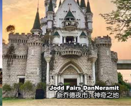
Jodd Fairs DanNeramit 新乔德夜市: 神奇之地