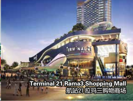
Terminal 21 Rama3 Shopping Mall 航站21拉玛三购物商场