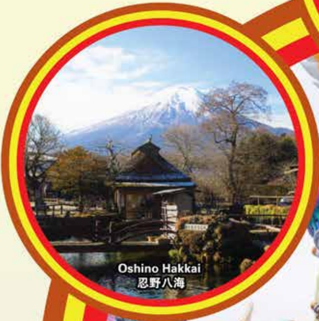
Oshino Hakkai 忍野八海