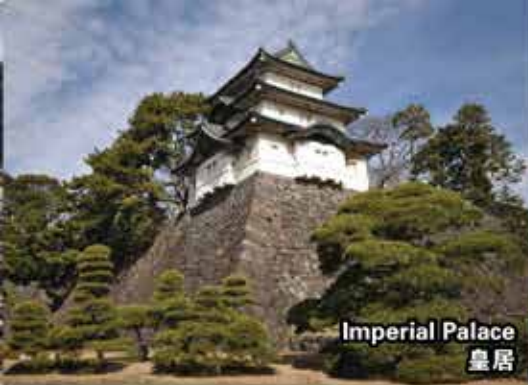
Imperial Palace 皇居