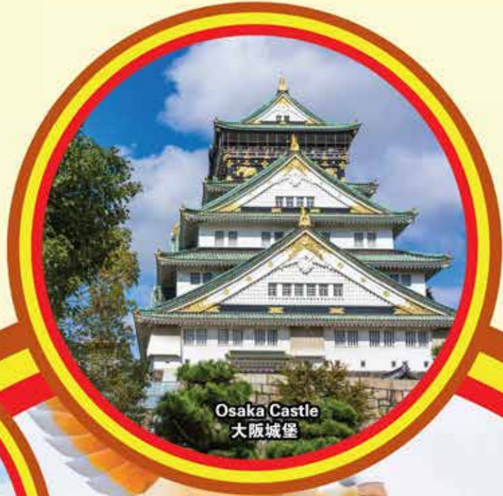
Osaka Castle 大阪城堡