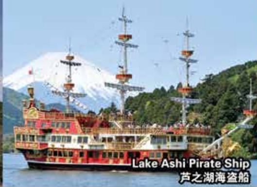
Lake Ashi Pirate Ship 芦之湖海盗船