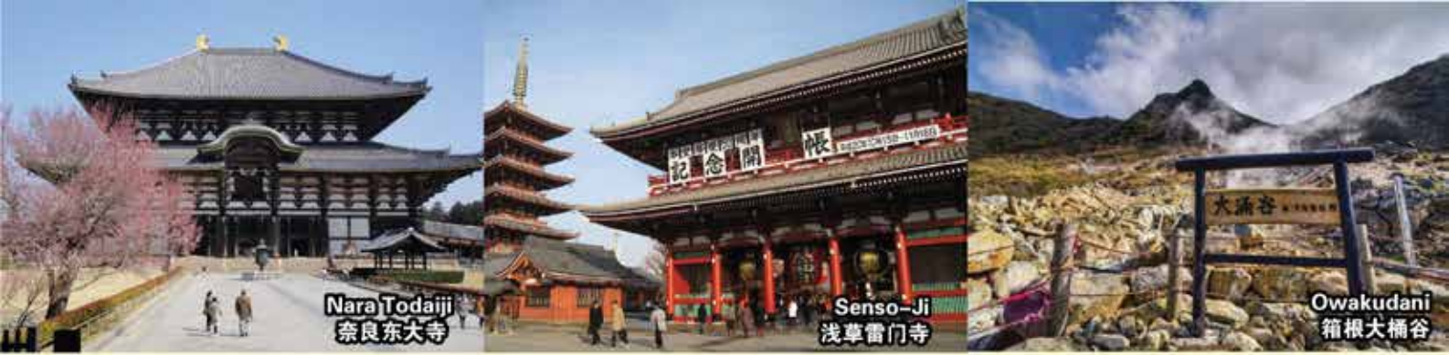
Nara Todaiji 奈良东大寺