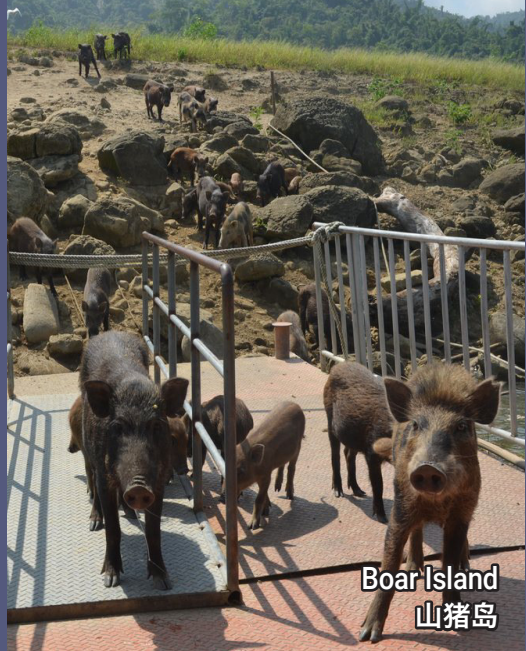
Boar Island 山猪岛