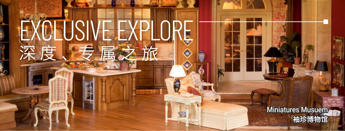
Miniatures Museum 袖珍博物馆