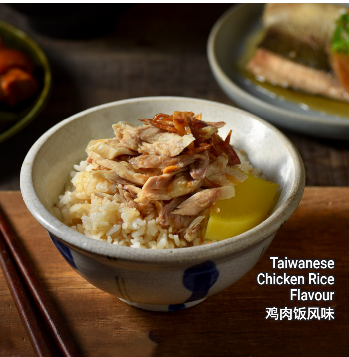
Taiwanese Chicken Rice Flavour 鸡肉饭风味