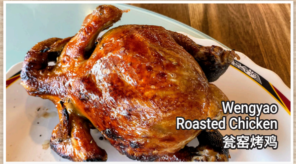
Wengyao Roasted Chicken 瓮窑烤鸡