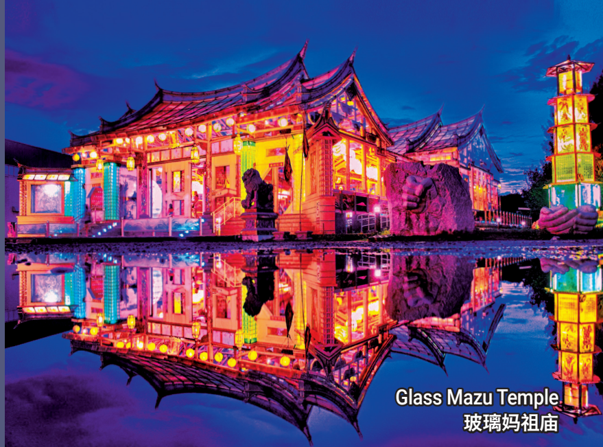
Glass Mazu Temple 玻璃妈祖庙