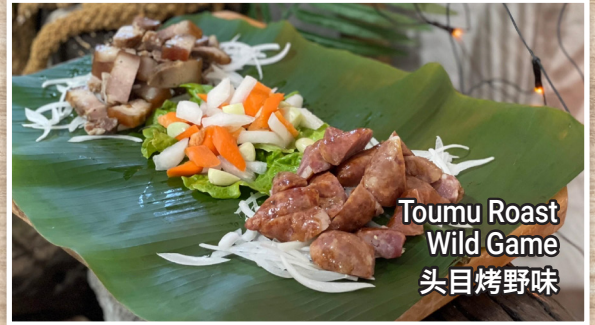
Toumu Roast Wild Game 头目烤野味