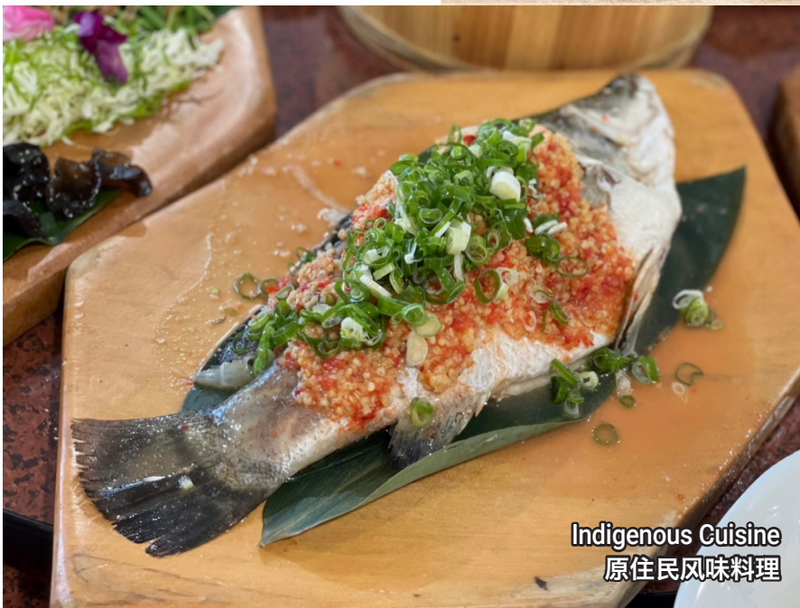
Indigenous Cuisine 原住民风味料理