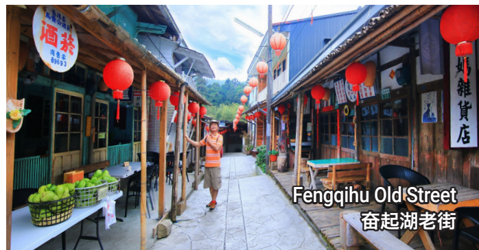
Fengqi Lake Old Street 奋起湖老街