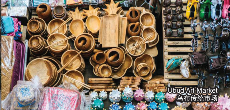
Ubud Art Market 乌布传统市场