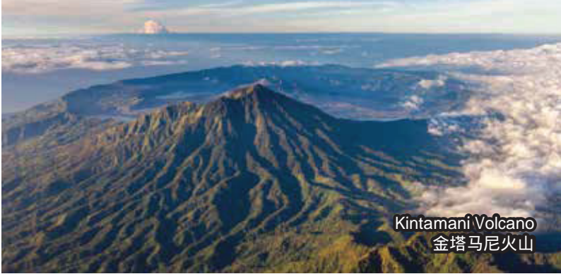
Kintamani Volcano 金塔马尼火山