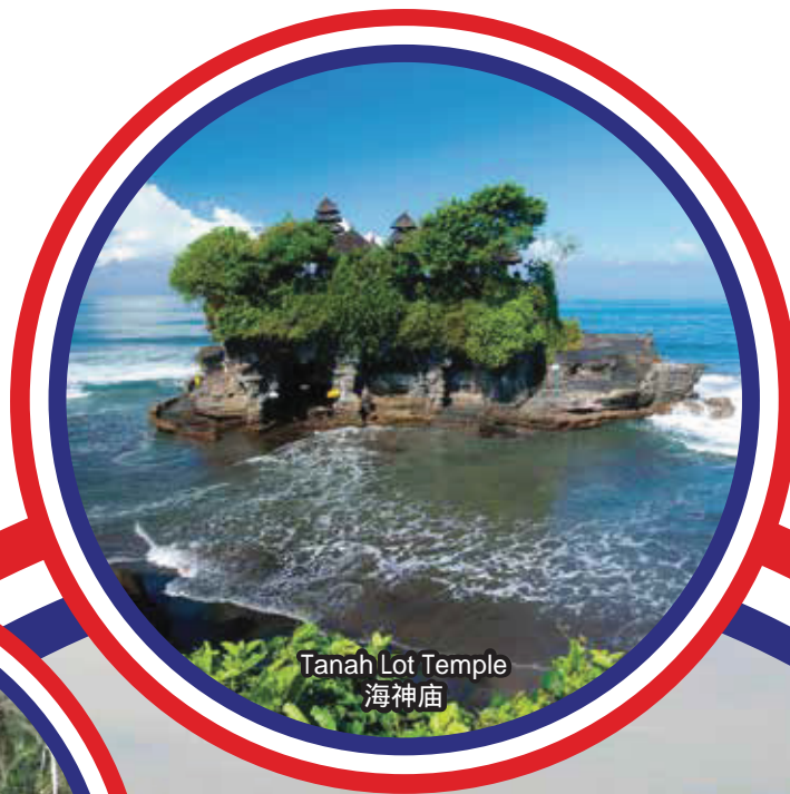
Tanah Lot Temple 海神庙