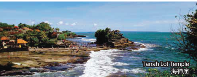
Tanah Lot Temple 海神庙