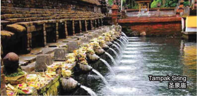
Tampak Siring 圣泉庙