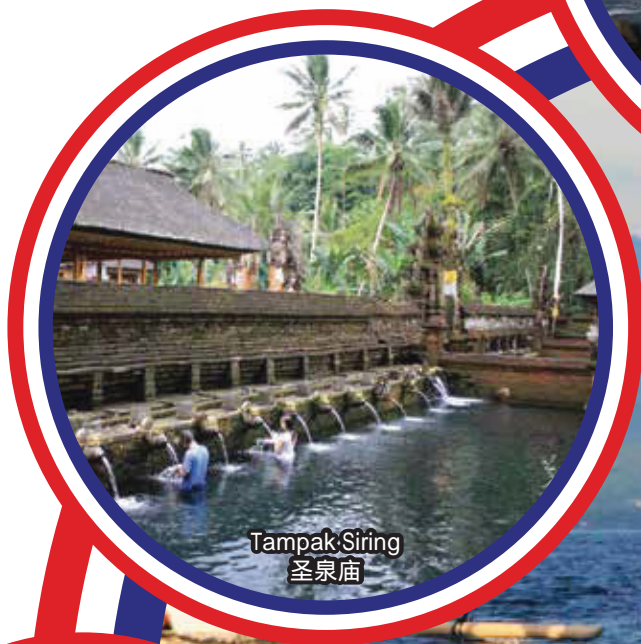
Tampak Siring 圣泉庙