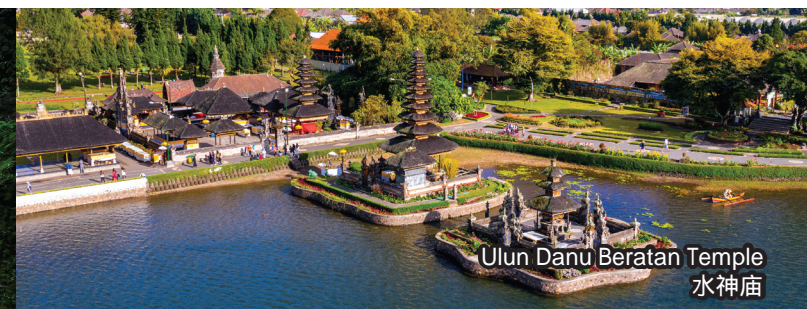
Ulun Danu Beratan Temple 水神庙

Disclaimer: Due to Covid-19 travel restrictions, local / religious festivals, public holidays, weather condition, transport technical issue, acts of nature, Golden Destinations reserved the right to alter the sequence or change, amend or alter the itinerary if necessary, with or without prior notice.