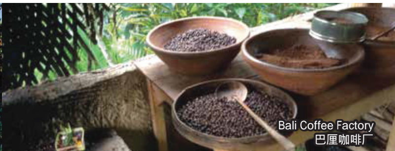
Bali Coffee Factory 巴厘咖啡厂

免责声明：由于新冠肺炎疫情旅行限制当地/宗教节日、公众假期、天气状况、交通等情况，自然灾害，必要时黄金旅程保留对行程进行适当调整（调整景点游览顺序）以确保行程顺利进行，会或否事先通知。