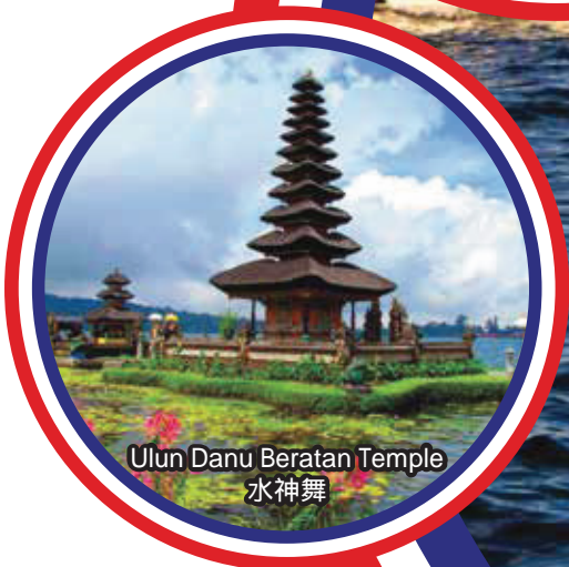
Ulun Danu Beratan Temple 水神舞

行程次序，以当地旅社安排为准。 Sequences of Itinerary are subject to local arrangement.