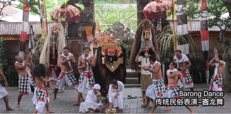
Barong Dance 传统民俗表演~峇龙舞