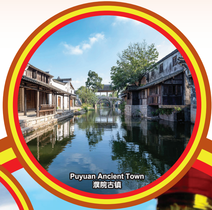
Puyuan Ancient Town 濮院古镇