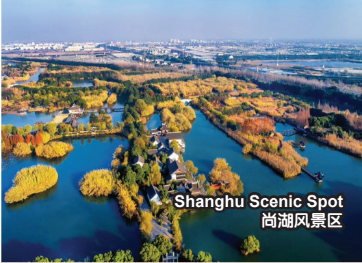
Shanghu Scenic Spot 尚湖风景区