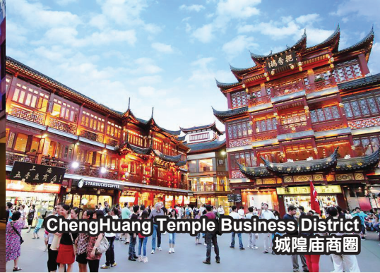
ChengHuang Temple Business District 城隍庙商圈