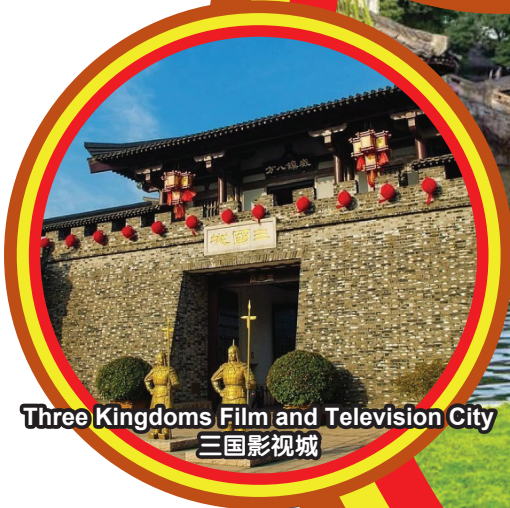
Three Kingdoms Film and Television City 三国影视城

行程次序，以当地旅社安排为准。 Sequences of Itinerary are subject to local arrangement.