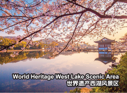
World Heritage West Lake Scenic Area 世界遗产西湖风景区