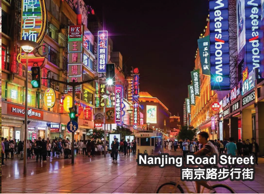
Nanjing Road Street 南京路步行街