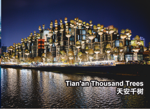
Tian'an Thousand Trees 天安千树