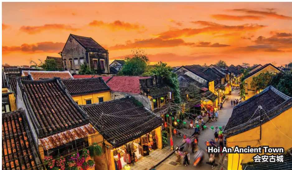
Hoi An/Ancient Town 会安古城

免责声明：由于新冠肺炎疫情旅行限制当地/宗教节日，公众假期，天气状况，交通等情况，自然灾害，必要时黄金旅程保留对行程进行适当调整（调整景点游览顺序）以确保行程顺利进行，会或否事先通知。