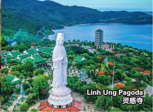
Linh Ung Pagoda 灵感寺