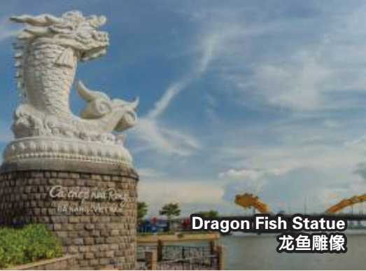
Dragon Fish Statue 龙鱼雕像