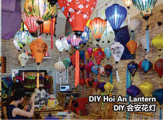
DIY Hoi An Lantern DIY 会安花灯