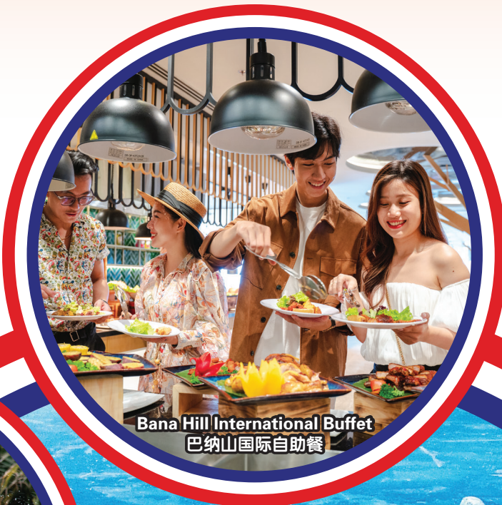
Bana Hill International Buffet 巴纳山国际自助餐