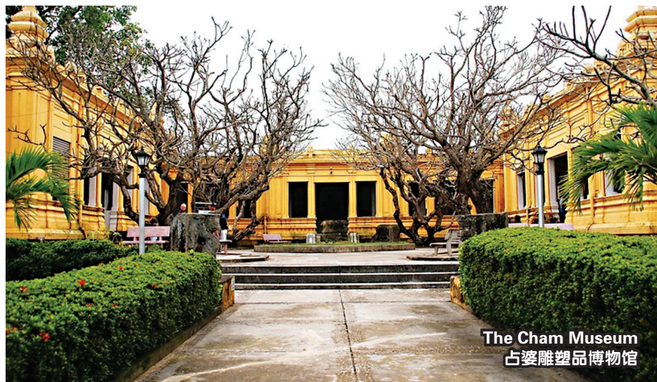
The Cham Museum 占婆雕塑品博物馆

Disclaimer: Due to Covid-19 travel restrictions, local / religious festivals, public holidays, weather condition, transport technical issue, acts of nature, Golden Destinations reserved the right to alter the sequence or change, amend or alter the itinerary if necessary, with or without prior notice.