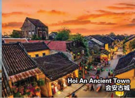
Hoi An Ancient Town 会安古城