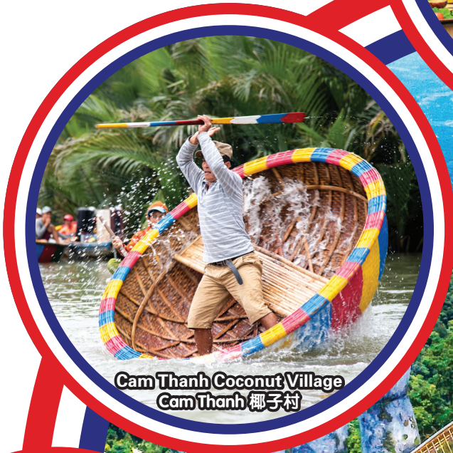
Cam Thanh Coconut Village Cam Thanh 椰子村