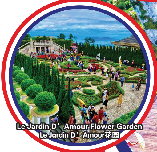
Le Jardin D' Amour Flower Garden Le Jardin D' Amour花园

行程次序，以当地旅社安排为准。 Sequences of Itinerary are subject to local arrangement.