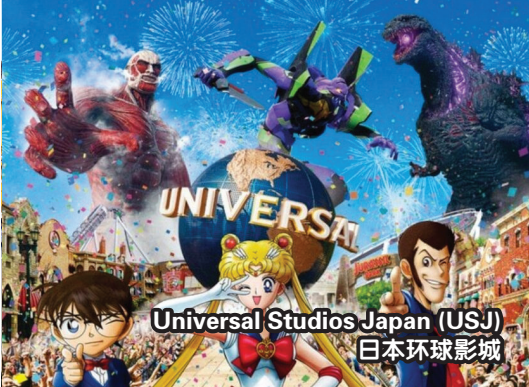
Universal Studios Japan (USJ) 日本环球影城