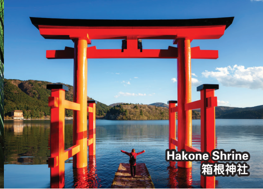
Hakone Shrine 箱根神社