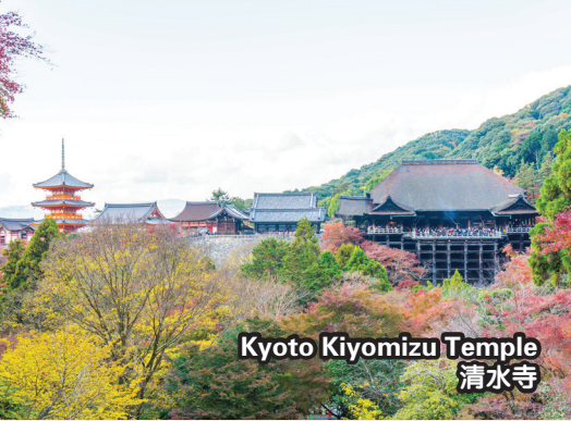
Kyoto Kiyomizu Temple 清水寺