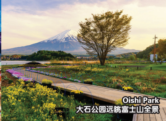
Oishi Park 大石公园远眺富士山全景