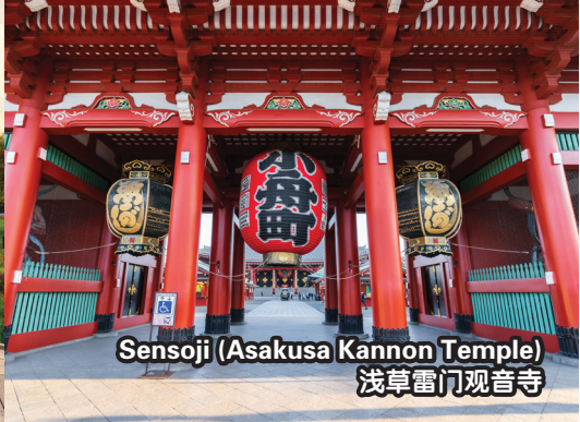
Sensoji (Asakusa Kannon Temple) 浅草雷门观音寺