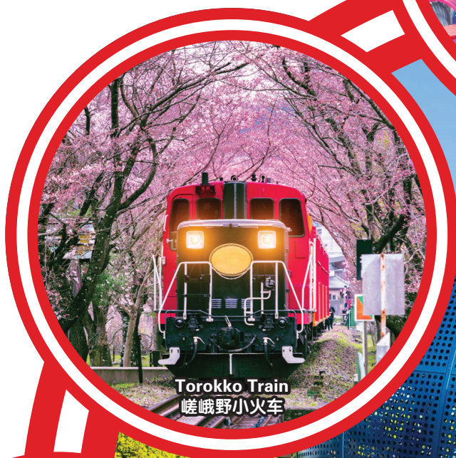
Torokko Train 嵯峨野小火车