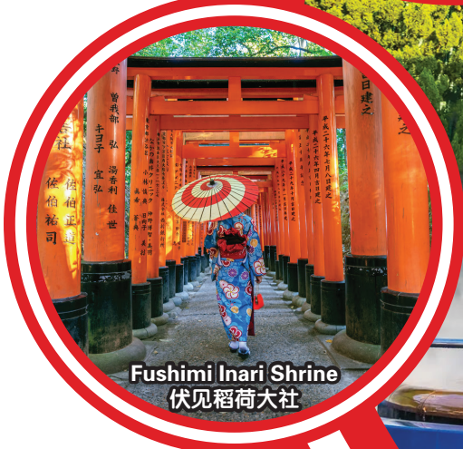
Fushimi Inari Shrine 伏见稻荷大社