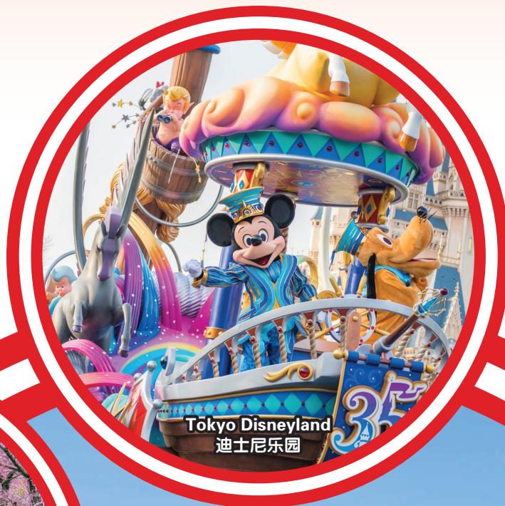
Tokyo Disneyland 迪士尼乐园