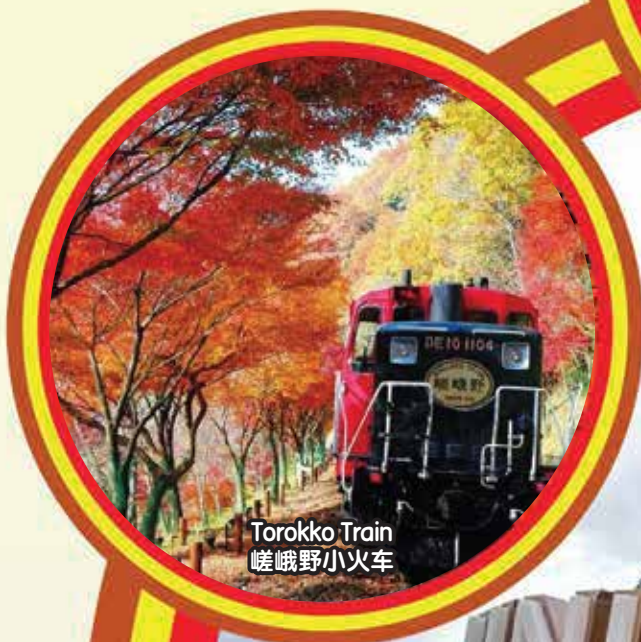
Torokko Train 嵯峨野小火车