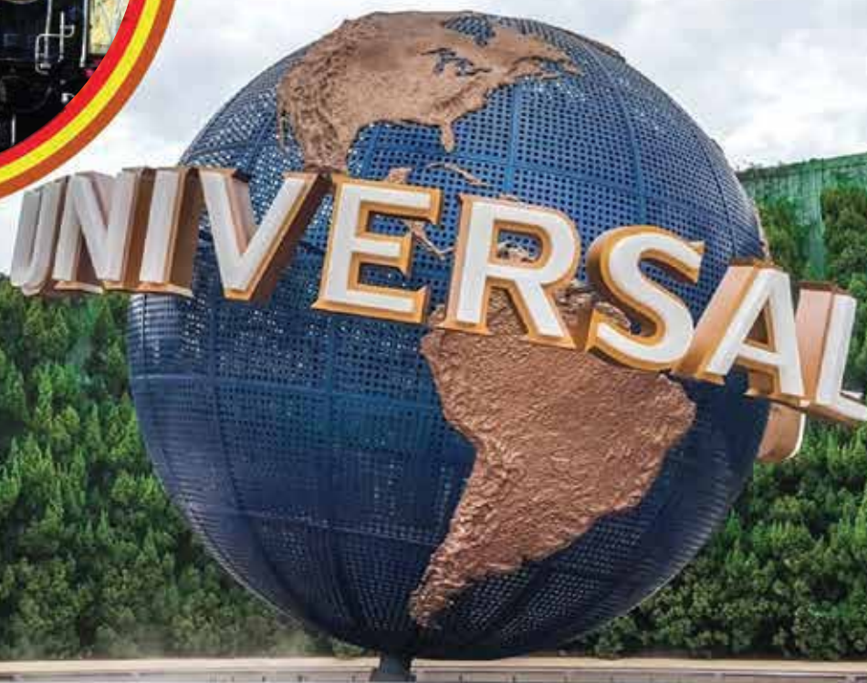
Universal Studios Japan (USJ) 日本环球影城

行程次序，以当地旅社安排为准。 Sequences of Itinerary are subject to local arrangement.