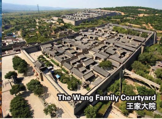
The Wang Family Courtyard 王家大院