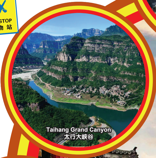
Taihang Grand Canyon 太行大峡谷