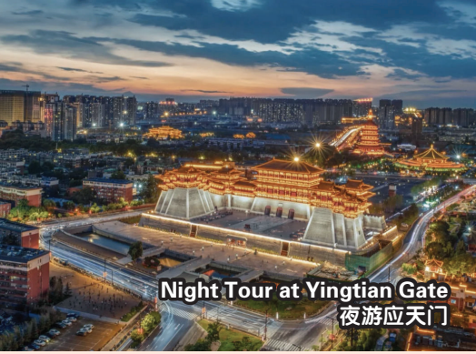
Night Tour at Yingtian Gate 夜游应天门