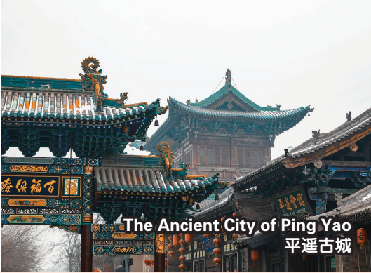
The Ancient City of Ping Yao 平遥古城