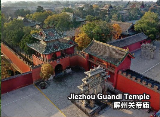
Jiezhou Guandi Temple 解州关帝庙