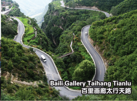
Baili Gallery Taihang Tianlu 百里画廊太行天路