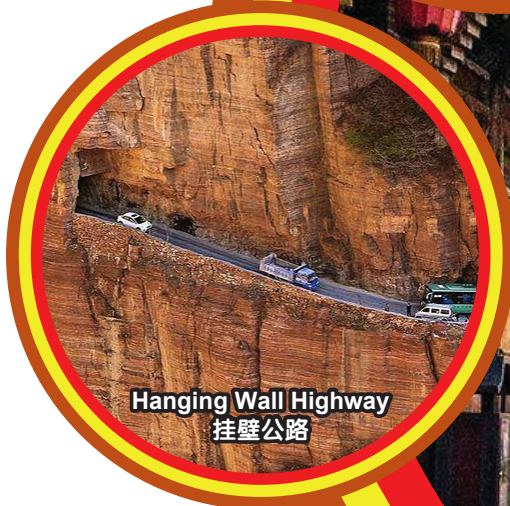
Hanging Wall Highway 挂壁公路