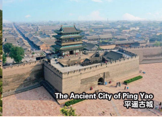
The Ancient City of Ping Yao 平遥古城