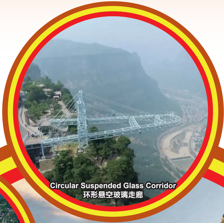
Circular Suspended Glass Corridor 环形悬空玻璃走廊

特别赠送 SPECIAL GIFT 4月游览牡丹园 Visit Peony Garden in April