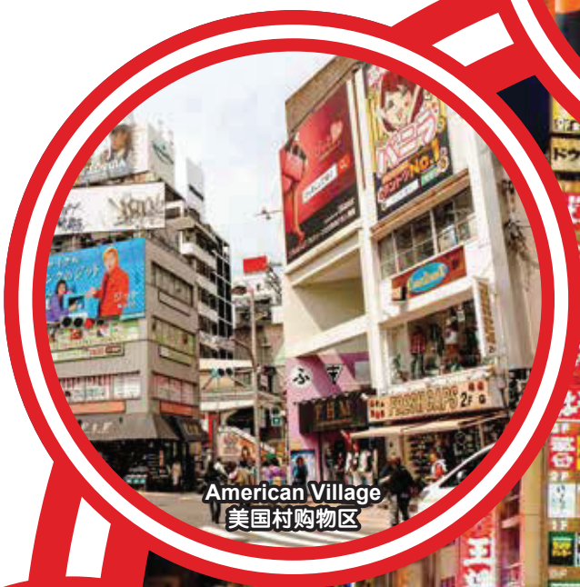
American Village 美国村购物区