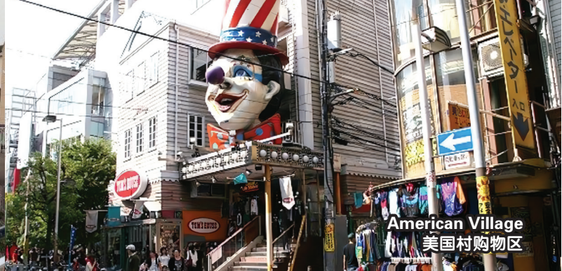
American Village 美国村购物区