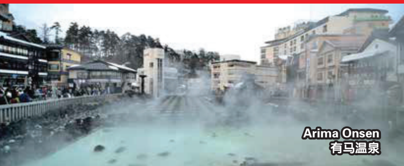
Arima Onsen 有马温泉

Optional Tour: Miyama, Nishiki Market, Arashiyama, Togetsukyo Bridge, Arashiyama Bamboo Grove. JPY13,000 Per Person [The below optional price is based on the number of participants; And for child price are same as the adult price (Except infant who does not occupy the seat)]