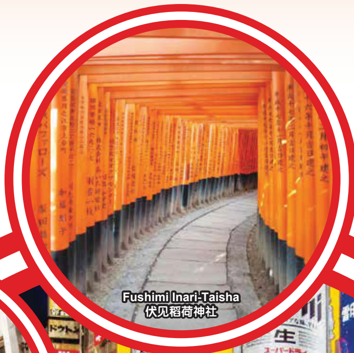
Fushimi Inari-Taisha 伏见稻荷神社