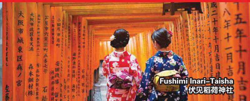
Fushimi Inari-Taisha 伏见稻荷神社

Disclaimer: Due to Covid-19 travel restrictions, local / religious festivals, public holidays, weather condition, transport technical issue, acts of nature, Golden Destinations reserved the right to alter the sequence or change, amend or alter the itinerary if necessary, with or without prior notice.