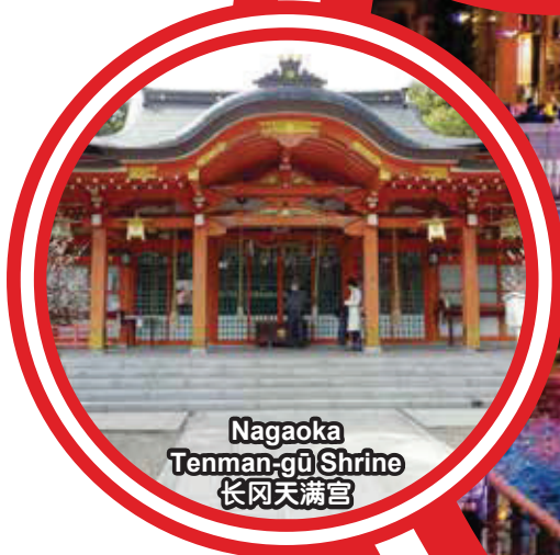
Nagaoka Tenman-gū Shrine 长冈天满宫