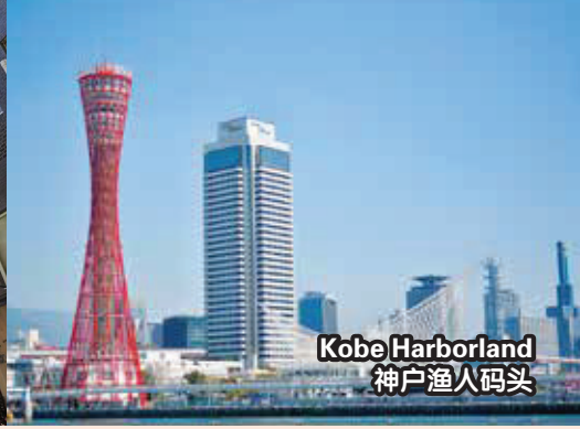
Kobe Harborland 神戸渔人码头