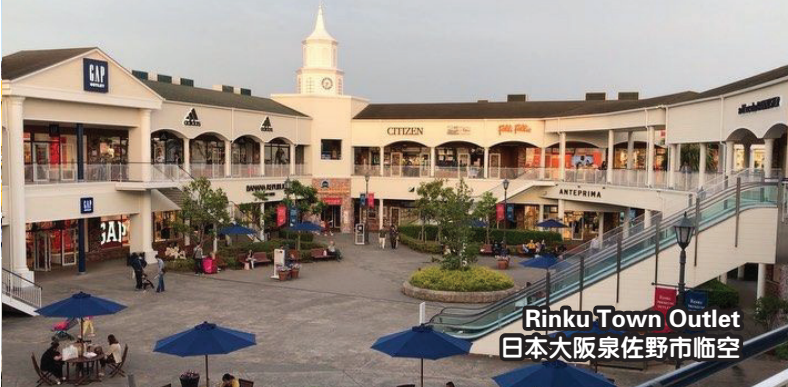
Rinku Town Outlet 日本大阪泉佐野市临空