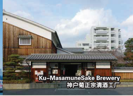
Ku-Masamune Sake Brewery 神戸菊正宗清酒工厂