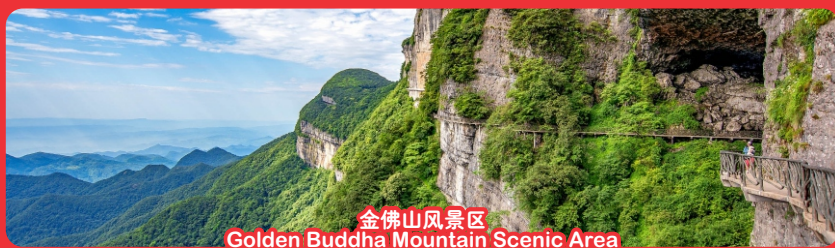
金佛山风景区 Golden Buddha Mountain Scenic Area

Wujiang Gallery - It is a scenic area characterized by natural scenery. This place is famous for its magnificent landscapes, clear rivers, unique geological landforms and rich ecological resources.