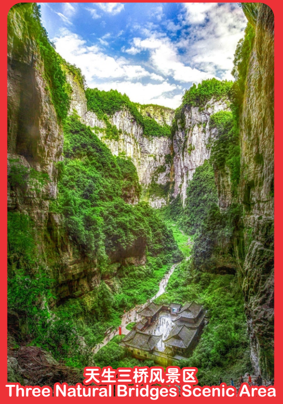
天生三桥风景区 Three Natural Bridges Scenic Area