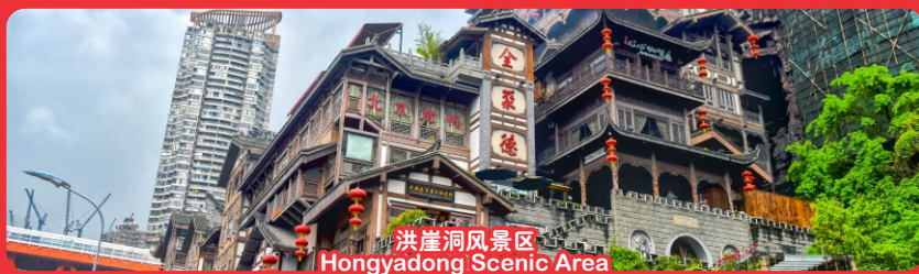
洪崖洞风景区 Hongyadong Scenic Area