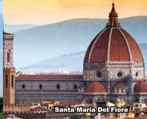
Santa Maria Del Fiore