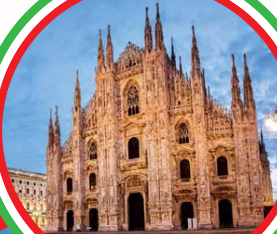
Milan Cathedral - Duomo