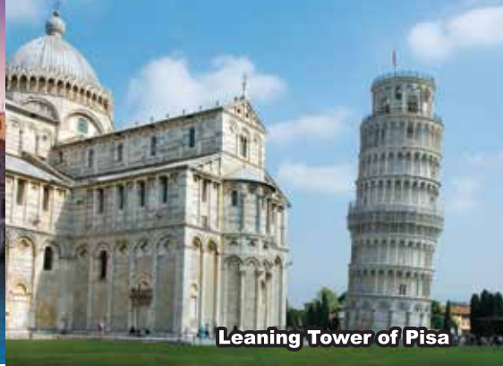
Leaning Tower of Pisa