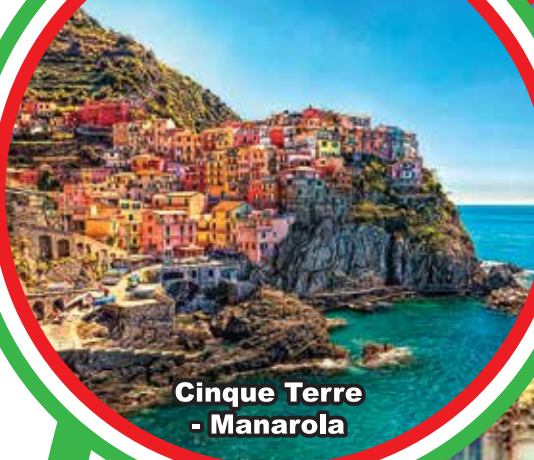
Cinque Terre - Manarola