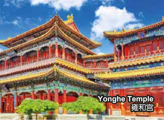
Yonghe Temple 雍和宫