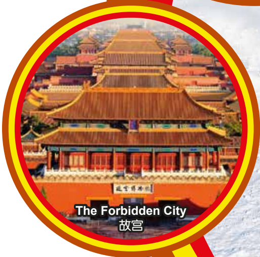
The Forbidden City 故宫