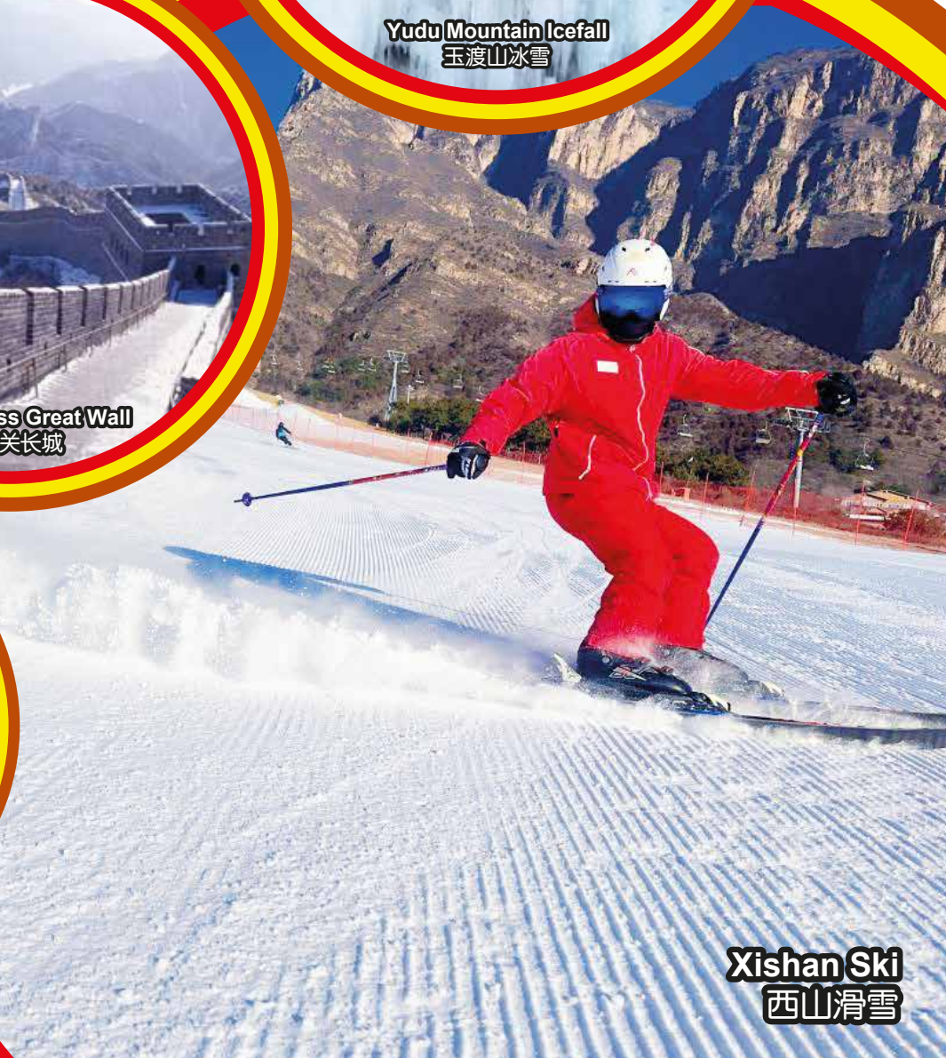
Xishan Ski 西山滑雪

行程次序，以当地旅社安排为准。 Sequences of Itinerary are subject to local arrangement.