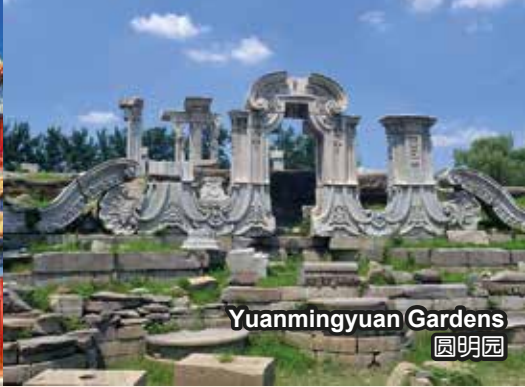
Yuanmingyuan Gardens 圆明园