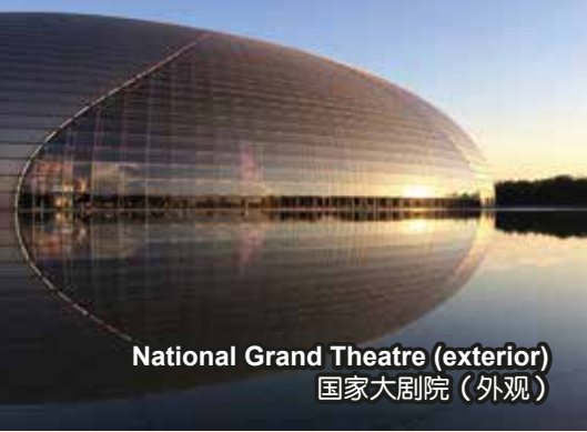
National Grand Theatre (exterior) 国家大剧院 (外观)