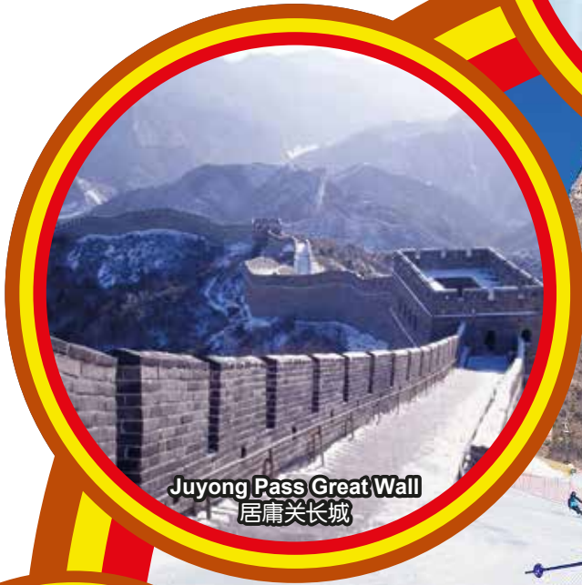
Juyong Pass Great Wall 居庸关长城