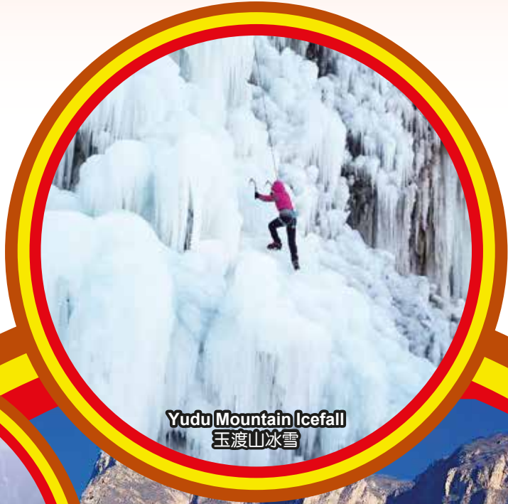
Yudu Mountain Icefall 玉渡山冰雪