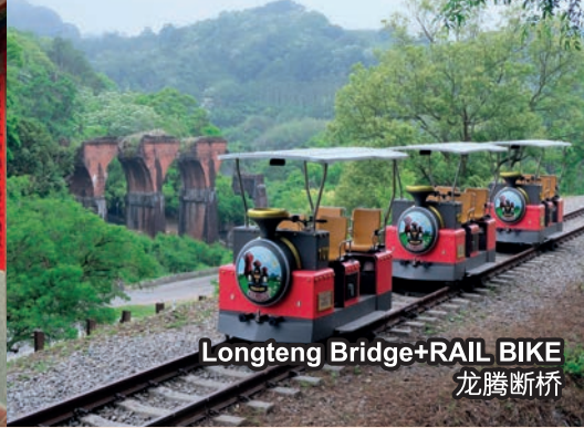
Longteng Bridge+RAIL BIKE 龙腾断桥