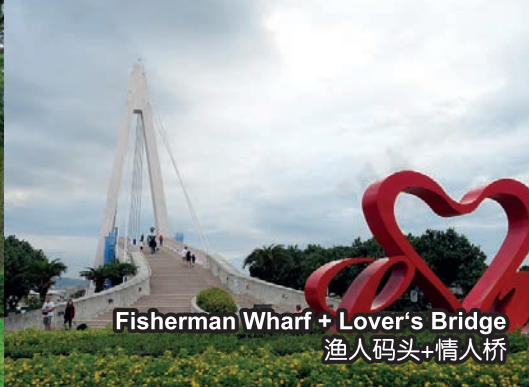
Fisherman Wharf + Lover's Bridge 渔人码头+情人桥