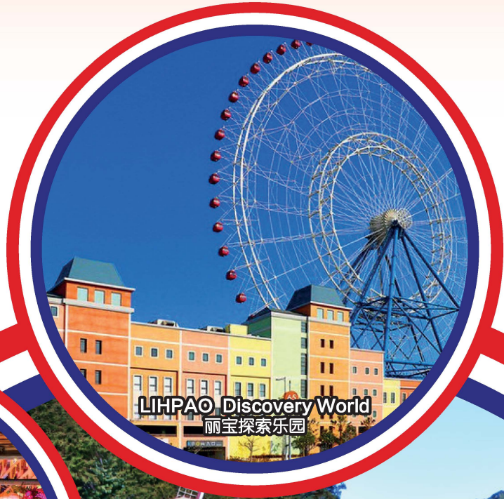
LIHPAO Discovery World 丽宝探索乐园