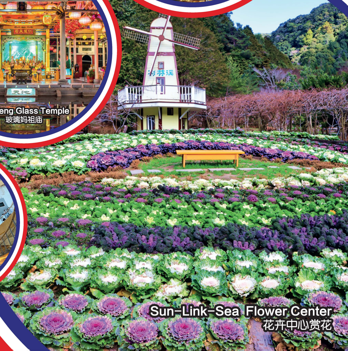
Sun-Link-Sea Flower Center 花卉中心赏花

行程次序，以当地旅社安排为准。 Sequences of Itinerary are subject to local arrangement.