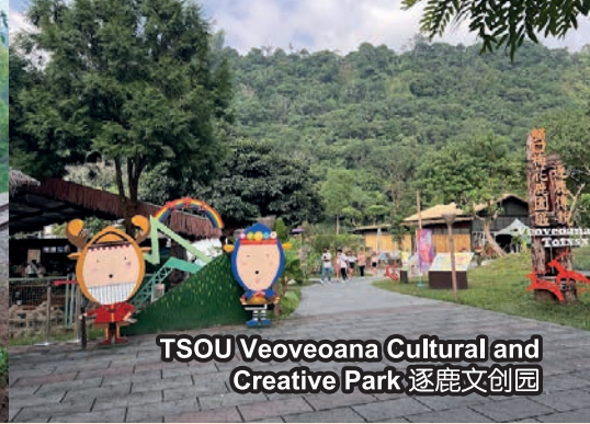
TSOU Veoveoana Cultural and Creative Park 逐鹿文创园