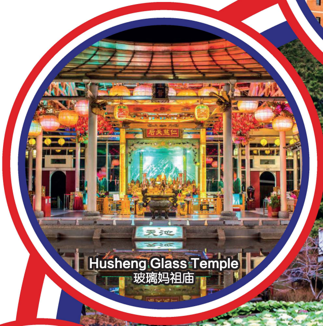
Husheng Glass Temple 玻璃妈祖庙