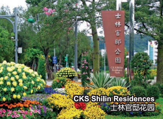
CKS Shilin Residences 士林官邸花园