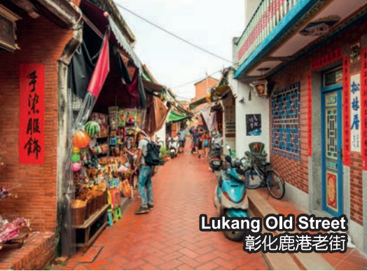
Lukang Old Street 彰化鹿港老街