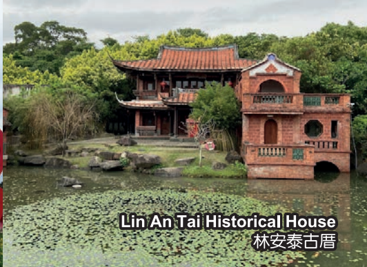
Lin An Tai Historical House 林安泰古厝