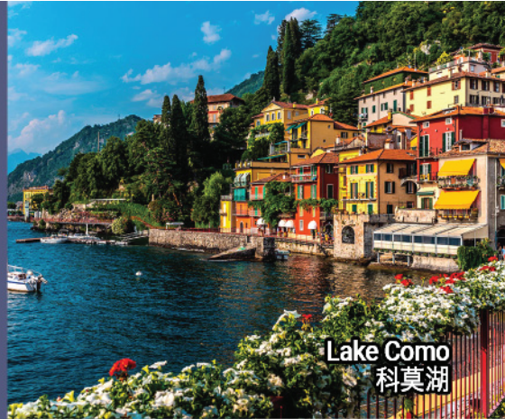
Lake Como 科莫湖