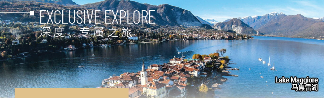
Lake Maggiore 马焦雷湖