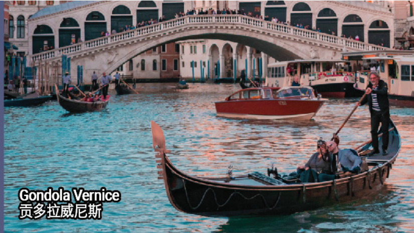
Gondola Vernice 贡多拉威尼斯