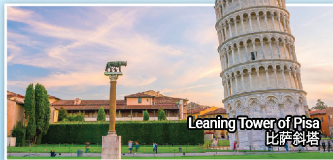
Leaning Tower of Pisa 比萨斜塔