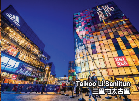
Taikoo Li Sanlitun 三里屯太古里