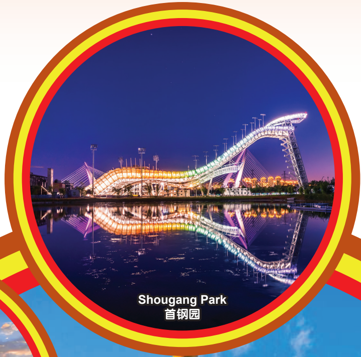
Shougang Park 首钢园