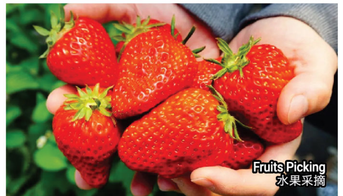
Fruits Picking 水果采摘