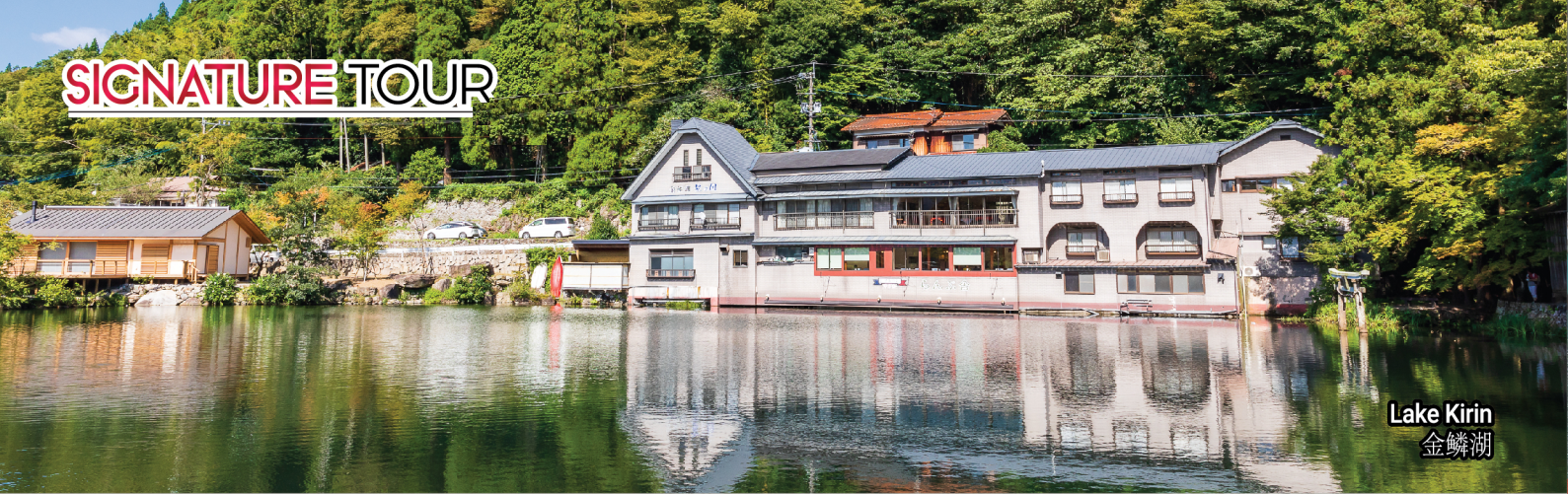
Lake Kirin 金鳞湖