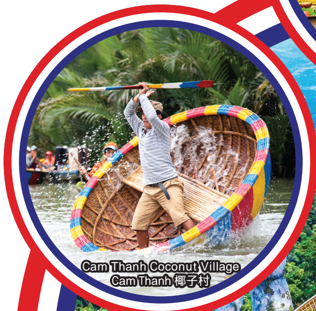
Cam Thanh Coconut Village Cam Thanh 椰子村