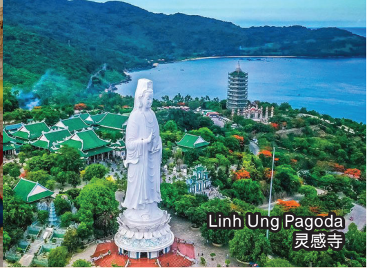
Linh Ung Pagoda 灵感寺