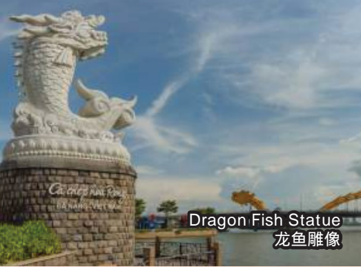
Dragon Fish Statue 龙鱼雕像