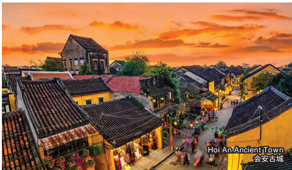
Hoi An/Ancient Town 会安古城

免责声明: 由于新冠肺炎疫情旅行限制当地/宗教节日, 公众假期, 天气状况, 交通等情况, 自然灾害, 必要时黄金旅程保留对行程进行适当调整 (调整景点游览顺序) 以确保行程顺利进行, 会或否事先通知。