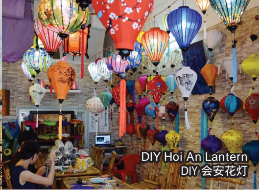
DIY Hoi An Lantern DIY 会安花灯