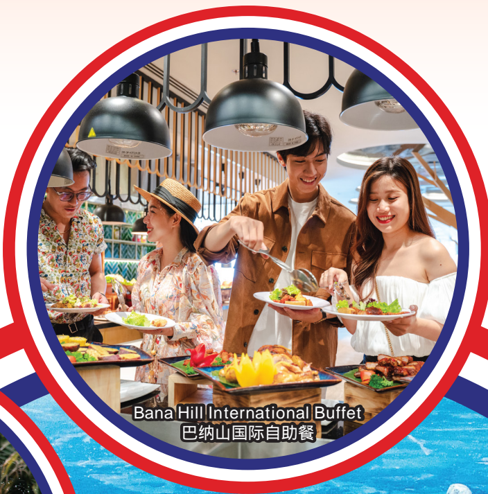
Bana Hill International Buffet 巴纳山国际自助餐