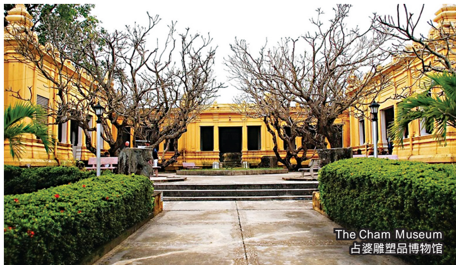
The Cham Museum 占婆雕塑品博物馆

Disclaimer: Due to Covid-19 travel restrictions, local / religious festivals, public holidays, weather condition, transport technical issue, acts of nature, Golden Destinations reserved the right to alter the sequence or change, amend or alter the itinerary if necessary, with or without prior notice.