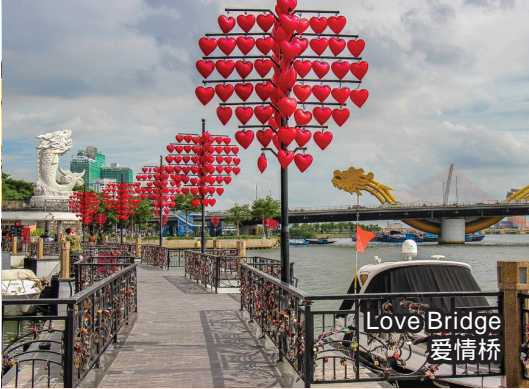
Love Bridge 爱情桥