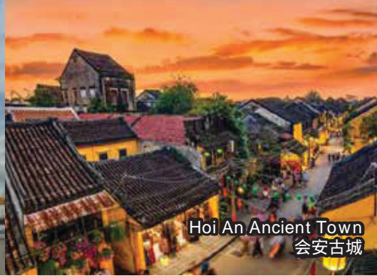
Hoi An Ancient Town 会安古城