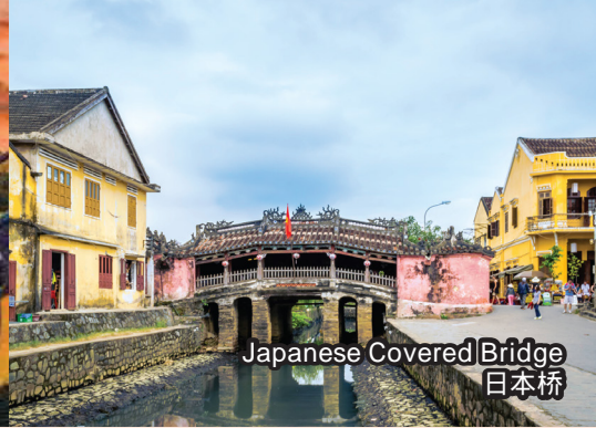
Japanese Covered Bridge 日本桥