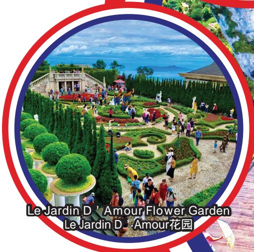
Le Jardin D'Amour Flower Garden Le Jardin D'Amour 花园

行程次序，以当地旅社安排为准。 Sequences of Itinerary are subject to local arrangement.