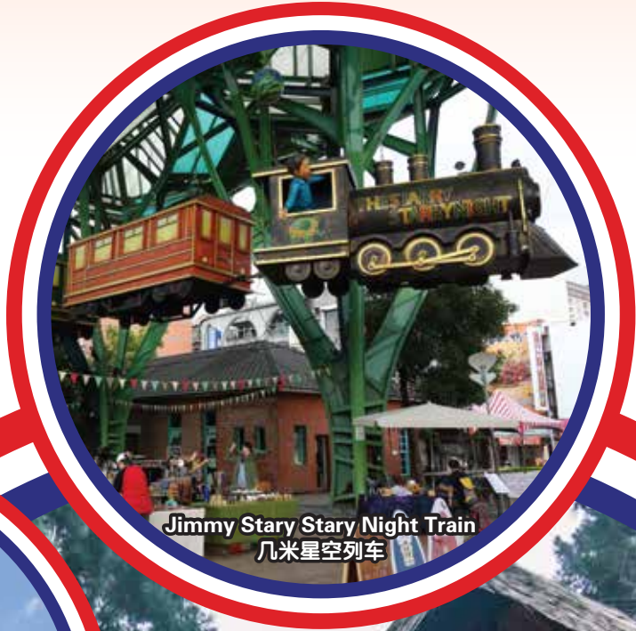
Jimmy Stary Stary Night Train 几米星空列车