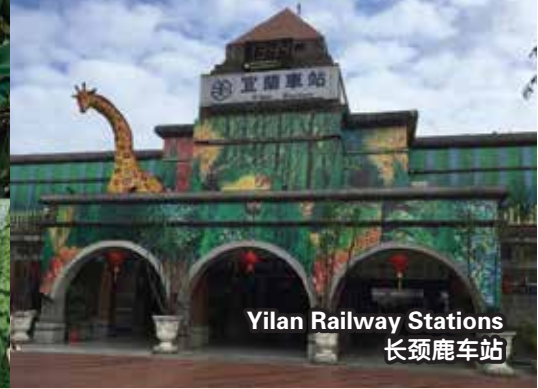
Yilan Railway Stations 长颈鹿车站