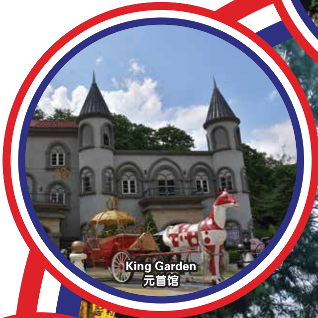
King Garden 元首馆