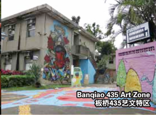
Banqiao 435 Art Zone 板桥435艺文特区