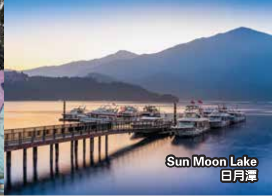
Sun Moon Lake 日月潭