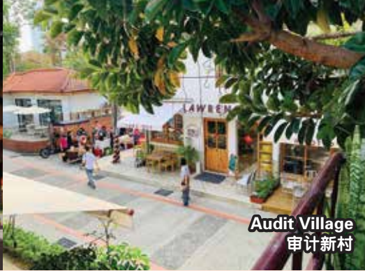
Audit Village 审计新村