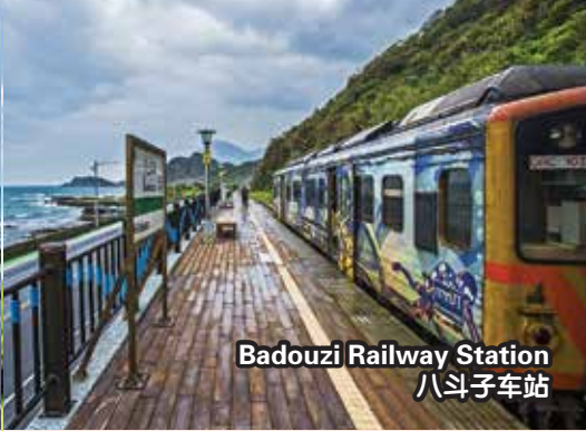
Badouzi Railway Station 八斗子车站