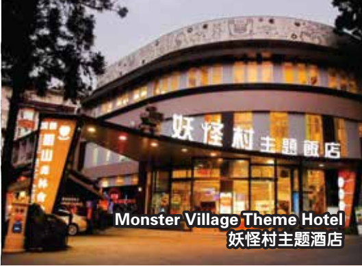
Monster Village Theme Hotel 妖怪村主题酒店