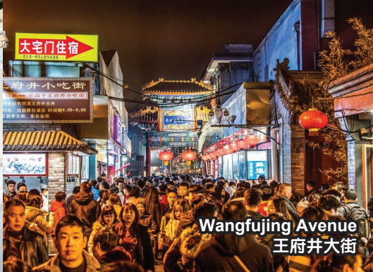
Wangfujing Avenue 王府井大街