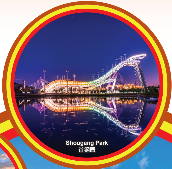
Shougang Park 首钢园