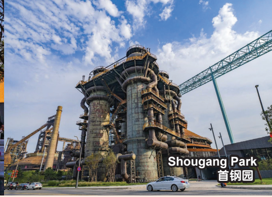
Shougang Park 首钢园