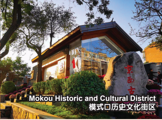
Moku Historic and Cultural District 模式口历史文化街区