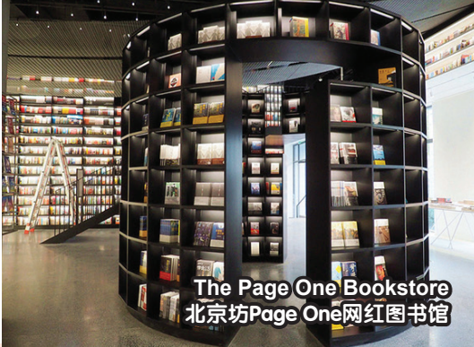
The Page One Bookstore 北京坊Page One网红图书馆