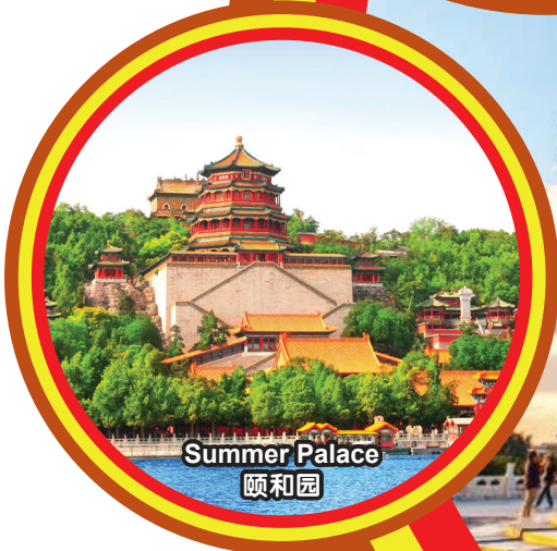
Summer Palace 颐和园