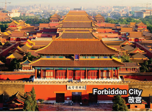
Forbidden City 故宫