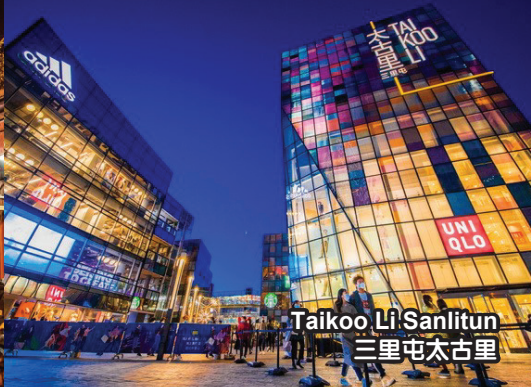
Taikoo Li Sanlitun 三里屯太古里