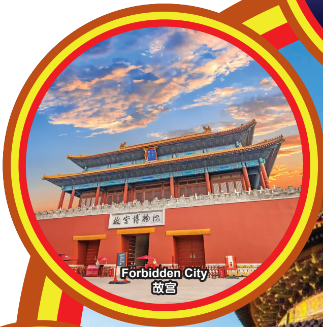
Forbidden City 故宫