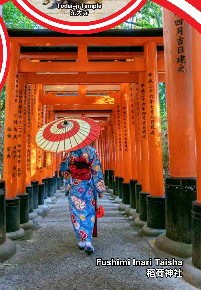
Fushimi Inari Taisha 稻荷神社

Sequences of Itinerary are subject to local arrangement. 行程次序, 以当地旅社安排为准。