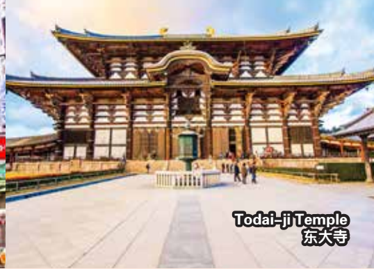
Todai-ji Temple 东大寺