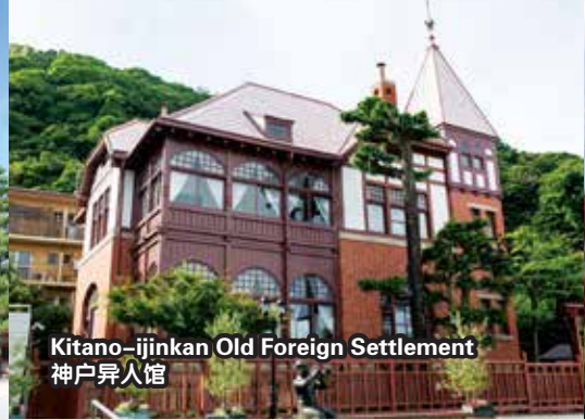
Kitano-ijinkan Old Foreign Settlement 神戸异人馆