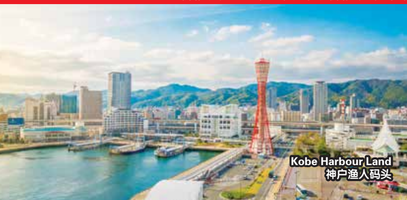
Kobe Harbour Land 神户渔人码头

自费行程: 美山町合掌村、锦市场、心斋桥、道顿堀。JPY 10,000/人 【价格以参加人数为准; 小孩价格与成人同价 (除婴儿外, 手抱婴儿不占座位不收费)】