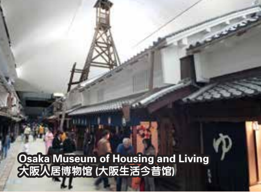
Osaka Museum of Housing and Living 大阪人居博物馆 (大阪生活今昔馆)