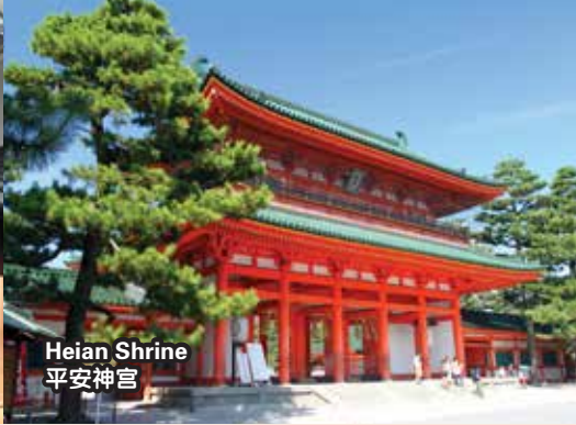
Heian Shrine 平安神宫