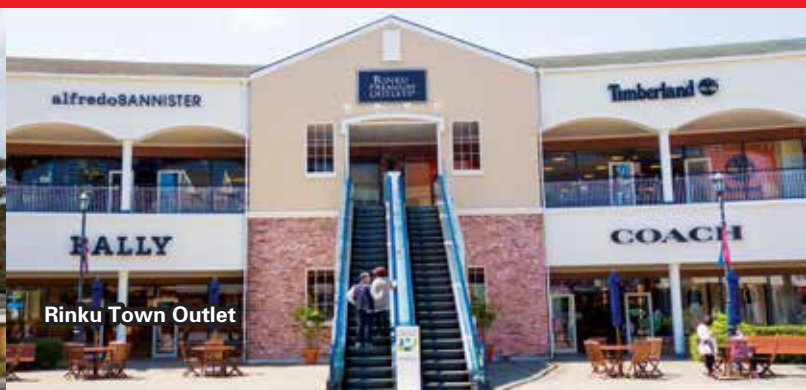
Rinku Town Outlet