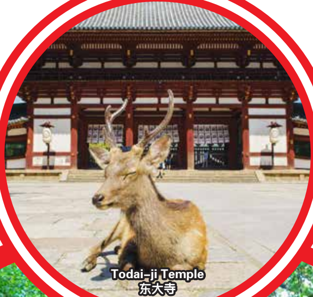
Todai-ji Temple 东大寺