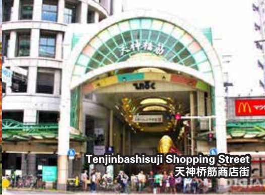
Tenjinbashisuji Shopping Street 天神桥筋商店街