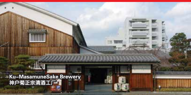
Ku-Masamune Sake Brewery 神戸菊正宗清酒工厂