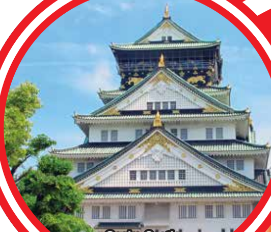
Osaka Castle 大阪城堡