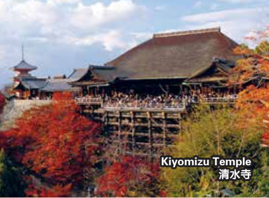
Kiyomizu Temple 清水寺