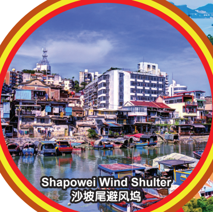
Shapowei Wind Shelter 沙坡尾避风坞