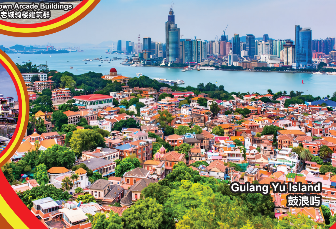
Gulang Yu Island 鼓浪屿

行程次序, 以当地旅社安排为准。 Sequences of Itinerary are subject to local arrangement.