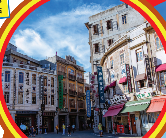
Old Town Arcade Buildings 老城骑楼建筑群