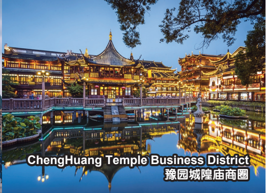
ChengHuang Temple Business District 豫园城隍庙商圈