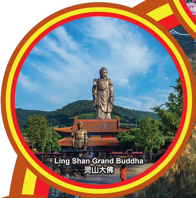
Ling Shan Grand Buddha 灵山大佛