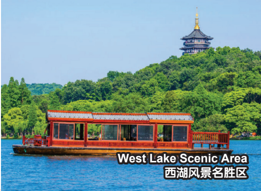
West Lake Scenic Area 西湖风景名胜