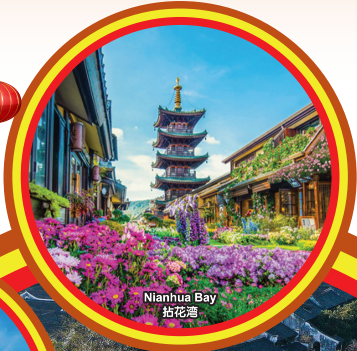
Nianhua Bay 拈花湾