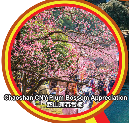
Chaoshan CNY Plum Blossom Appreciation 超山新春赏梅