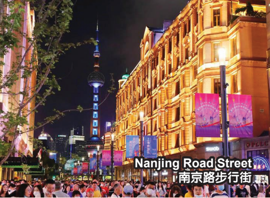
Nanjing Road Street 南京路步行街