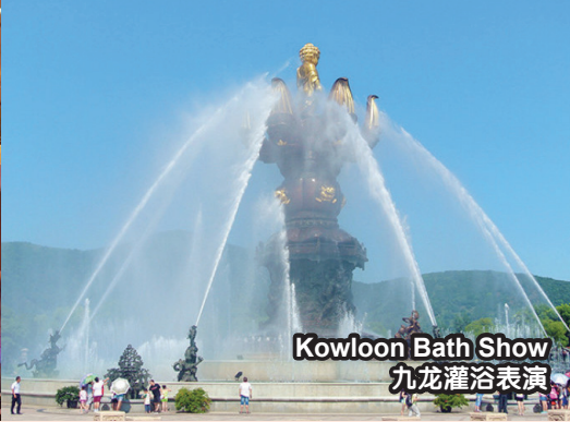
Kowloon Bath Show 九龙灌浴表演