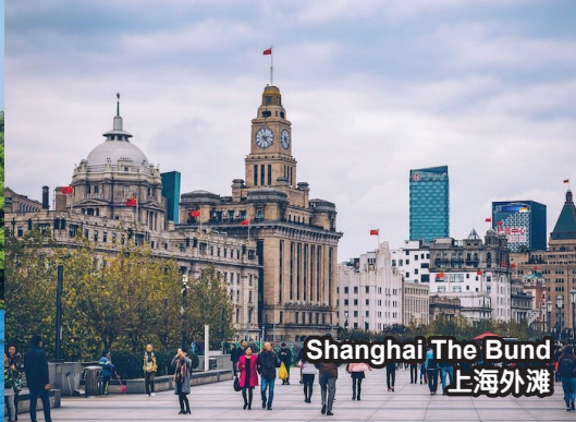
Shanghai The Bund 上海外滩