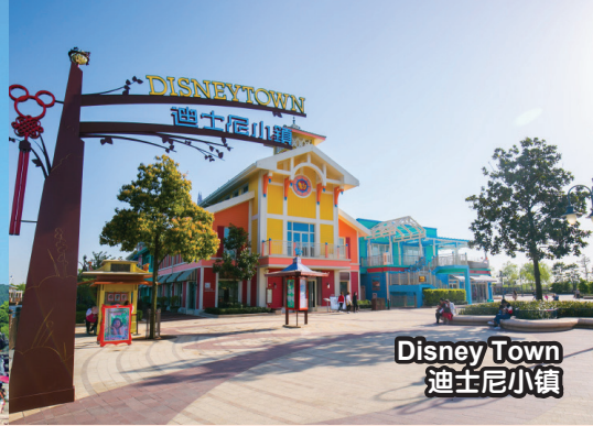
Disney Town 迪士尼小镇