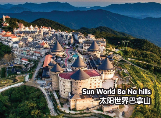
Sun World Ba Na hills 太阳世界巴拿山