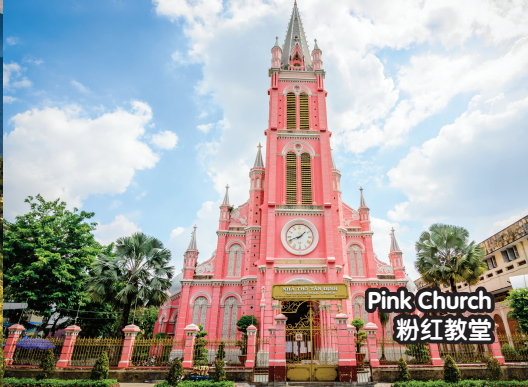
Pink Church 粉红教堂