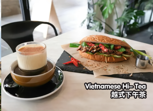
Vietnamese Hi-Tea 越式下午茶