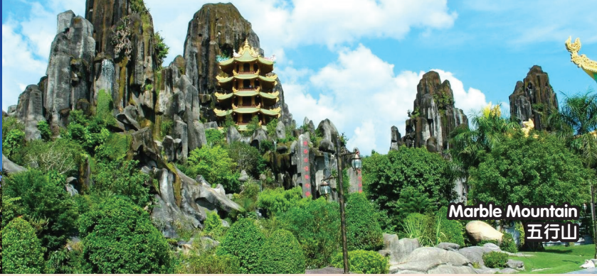
Marble Mountain 五行山