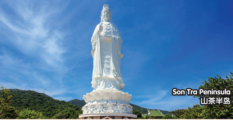
Son Tra Peninsula 山茶半岛