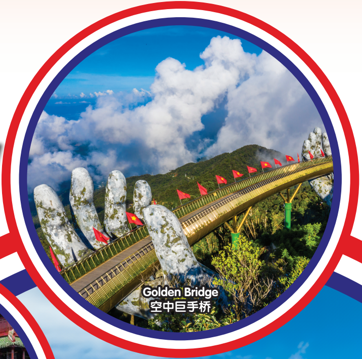
Golden Bridge 空中巨手桥