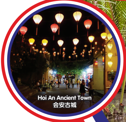
Hoi An Ancient Town 会安古城