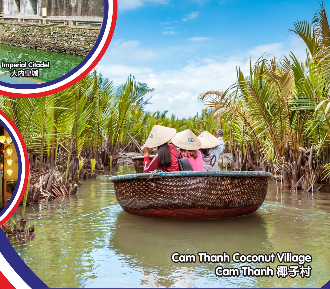
Cam Thanh Coconut Village Cam Thanh 椰子村