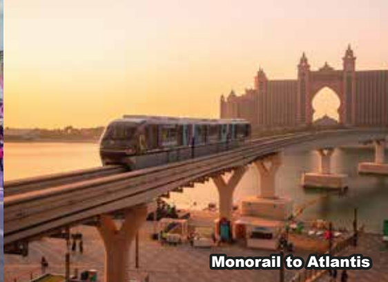
Monorail to Atlantis