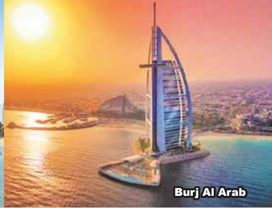
Burj Al Arab