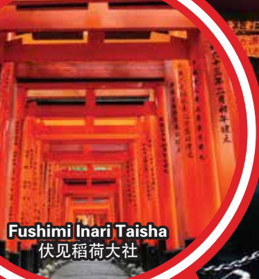
Fushimi Inari Taisha 伏见稻荷大社