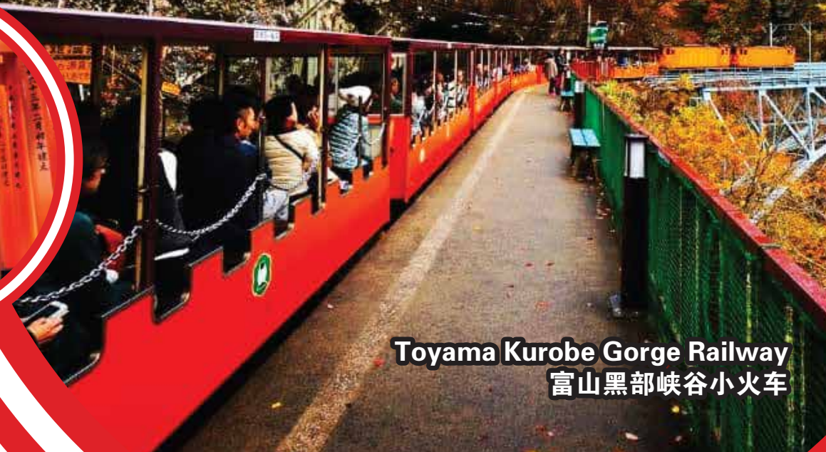
Toyama Kurobe Gorge Railway 富山黒部峡谷小火车

行程次序，以当地旅社安排为准。 Sequences of Itinerary are subject to local arrangement.