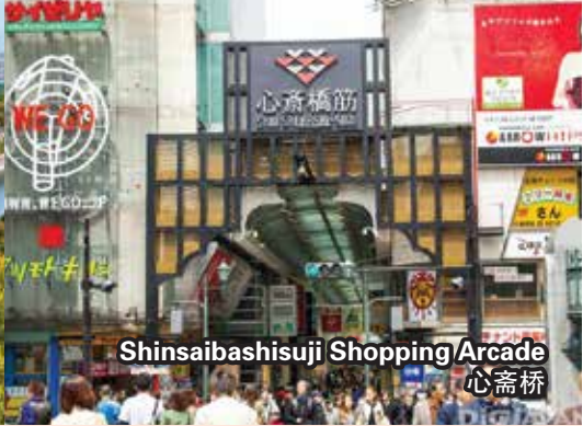
Shinsaibashisuji Shopping Arcade 心斋桥