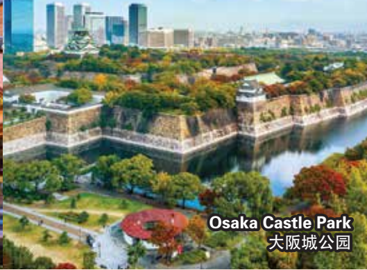
Osaka Castle Park 大阪城公园