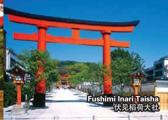
Fushimi Inari Taisha 伏见稻荷大社