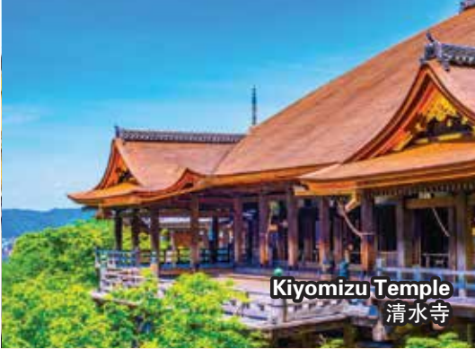
Kiyomizu Temple 清水寺