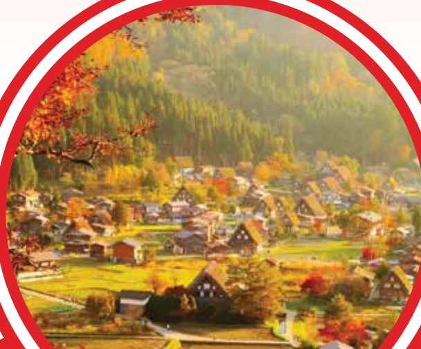
Shirakawa-Go Village 白川乡合掌村