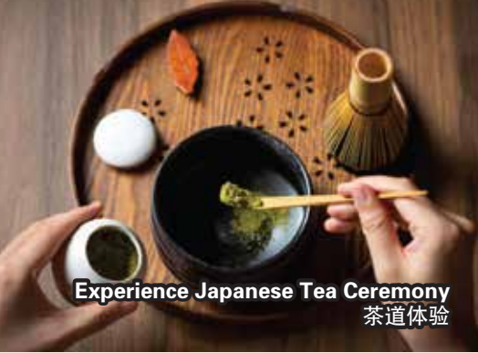
Experience Japanese Tea Ceremony 茶道体验