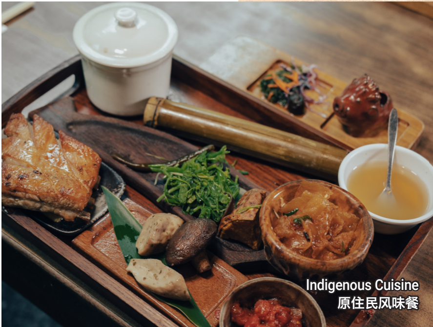
Indigenous Cuisine 原住民风味餐