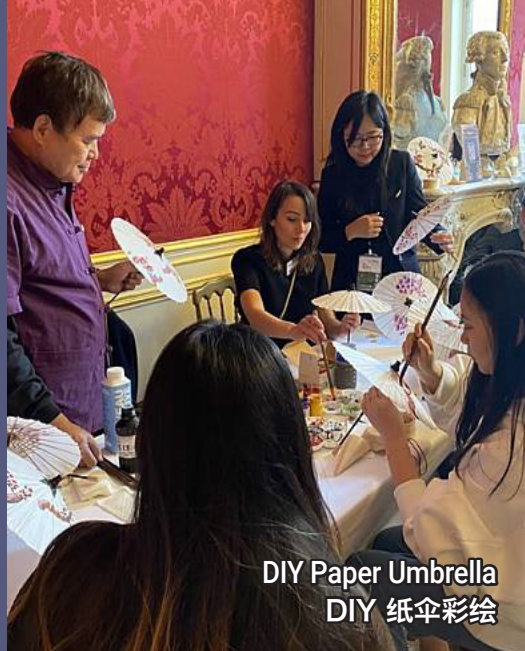
DIY Paper Umbrella DIY 纸伞彩绘