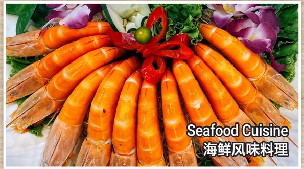
Seafood Cuisine 海鲜风味料理