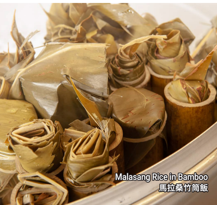
Malasang Rice in Bamboo 馬拉桑竹筒飯