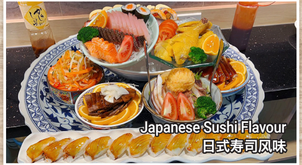
Japanese Sushi Flavour 日式寿司风味