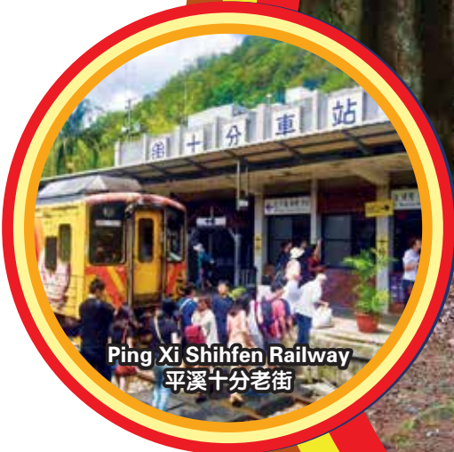
Ping Xi Shihfen Railway 平溪十分老街

Sequences of Itinerary are subject to local arrangement. 行程次序, 以当地旅社安排为准。