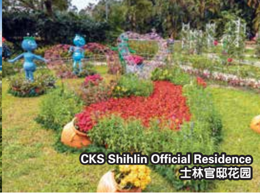
CKS Shihlin Official Residence 士林官邸花园