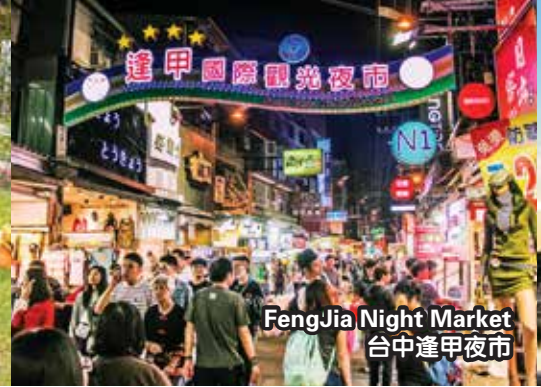
FengJia Night Market 台中逢甲夜市