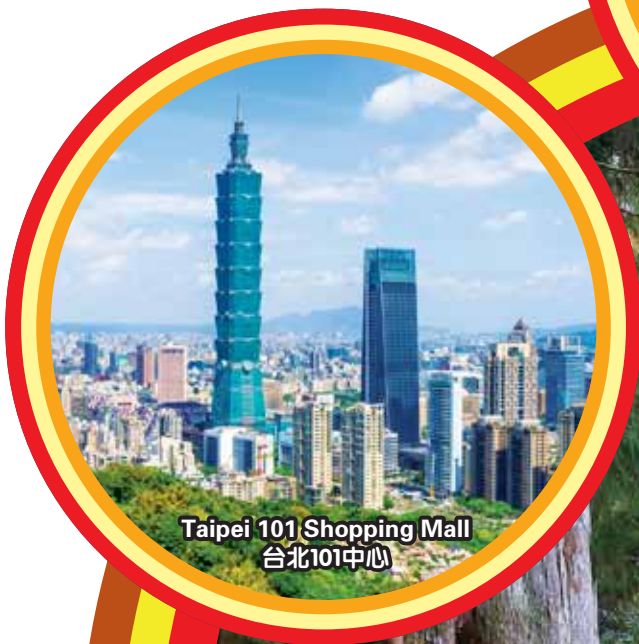
Taipei 101 Shopping Mall 台北101中心