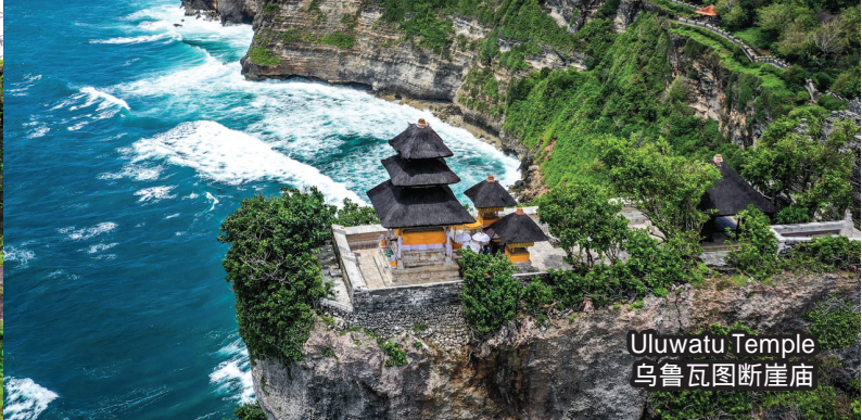
Uluwatu Temple 乌鲁瓦图断崖庙