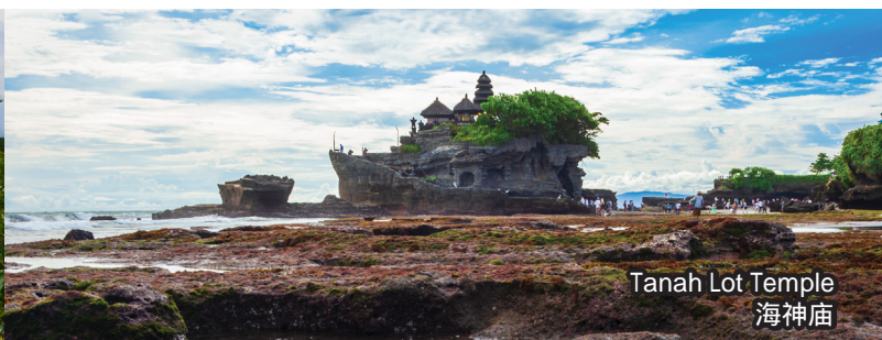
Tanah Lot Temple 海神庙

免责声明：由于新冠肺炎疫情旅行限制当地/宗教节日，公众假期，天气状况，交通等情况，自然灾害，必要时黄金旅程保留对行程进行适当调整（调整景点游览顺序）以确保行程顺利进行，会或否事先通知。