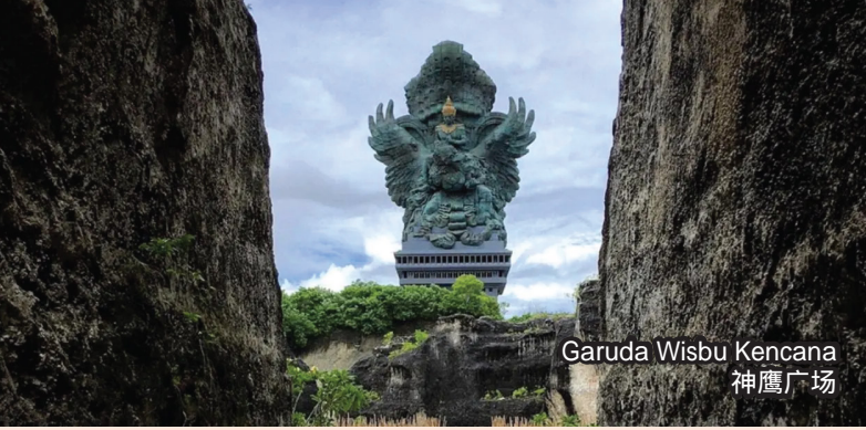
Garuda Wisbu Kencana 神鷹广场