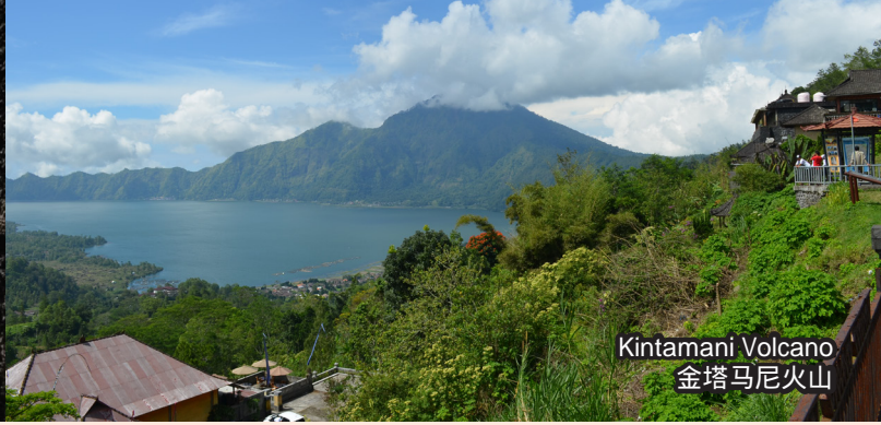
Kintamani Volcano 金塔马尼火山