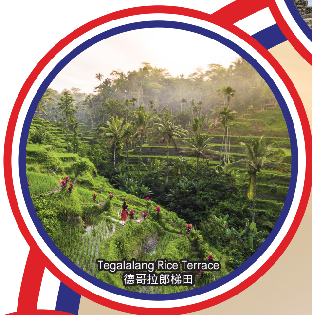
Tegalalang Rice Terrace 德哥拉郎梯田