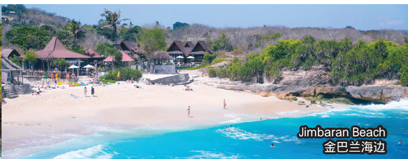
Jimbaran Beach 金巴兰海边

Disclaimer: Due to Covid-19 travel restrictions, local / religious festivals, public holidays, weather condition, transport technical issue, acts of nature, Golden Destinations reserved the right to alter the sequence or change, amend or alter the itinerary if necessary, with or without prior notice.