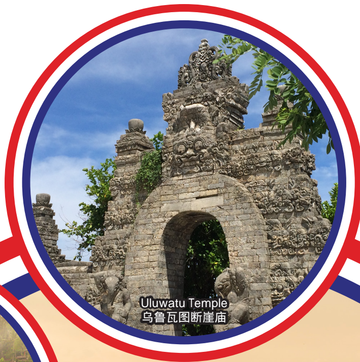
Uluwatu Temple 乌鲁瓦图断崖庙