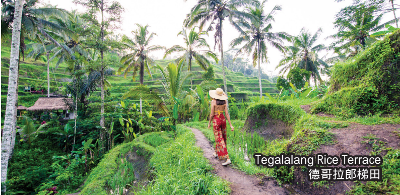
Tegalalang Rice Terrace 德哥拉郎梯田