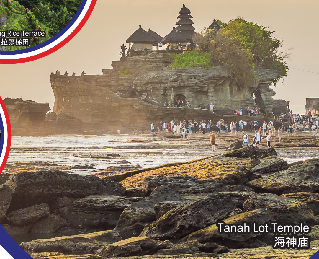
Tanah Lot Temple 海神庙

行程次序，以当地旅社安排为准。 Sequences of Itinerary are subject to local arrangement.