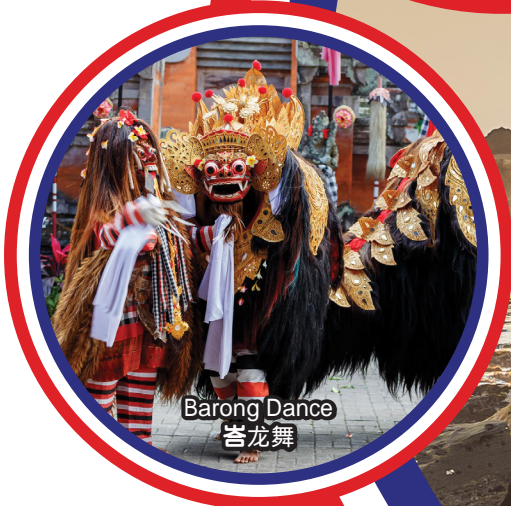
Barong Dance 峇龙舞

行程次序，以当地旅社安排为准。 Sequences of Itinerary are subject to local arrangement.