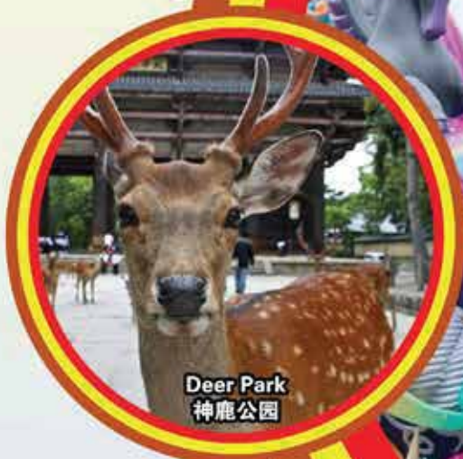
Deer Park 神鹿公园