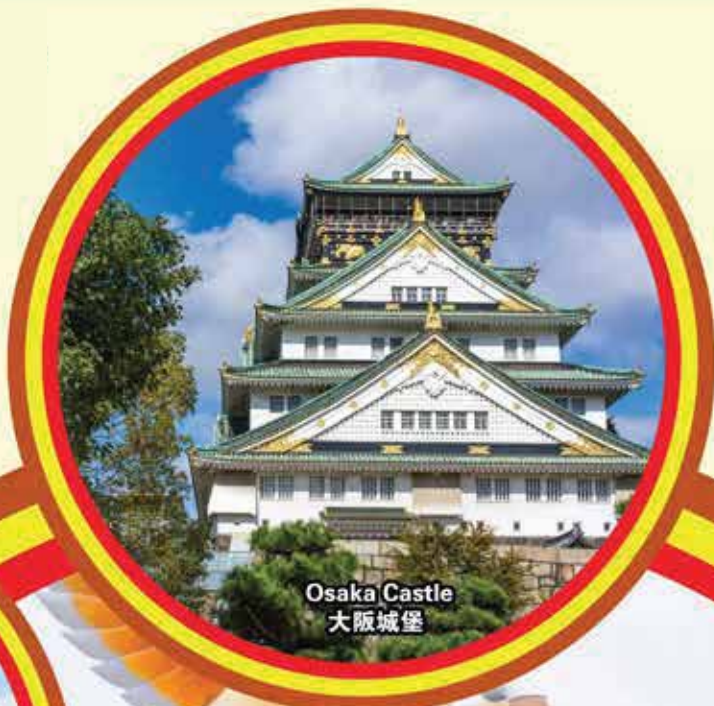
Osaka Castle 大阪城堡