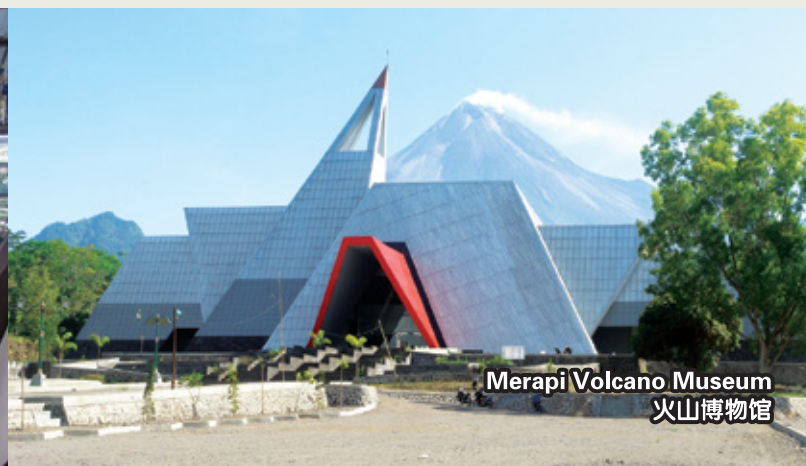
Merapi Volcano Museum 火山博物馆