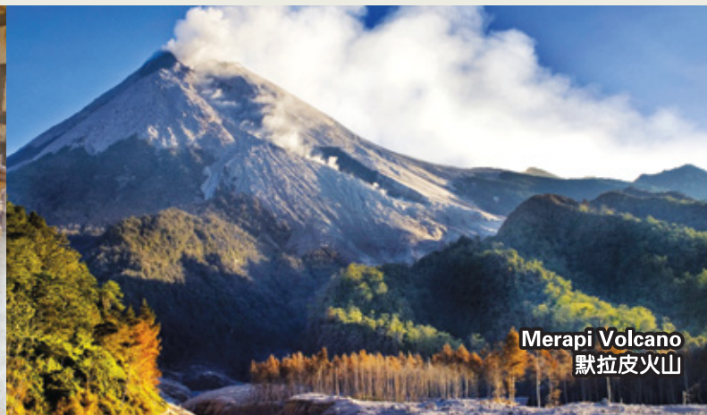
Merapi Volcano 默拉皮火山