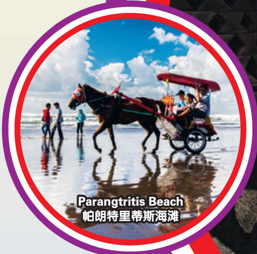
Parangtritis Beach 帕朗特里蒂斯海滩

行程次序，以当地旅社安排为准。 Sequences of Itinerary are subject to local arrangement.