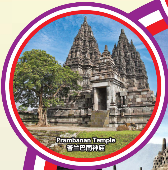
Prambanan Temple 普兰巴南神庙