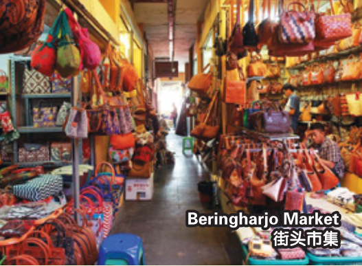
Beringharjo Market 街头市集