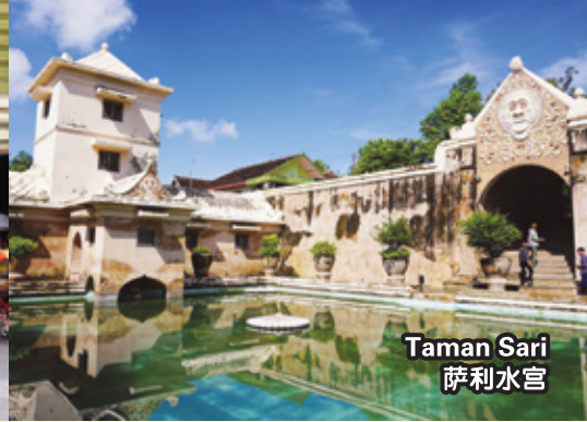
Taman Sari 萨利水宫