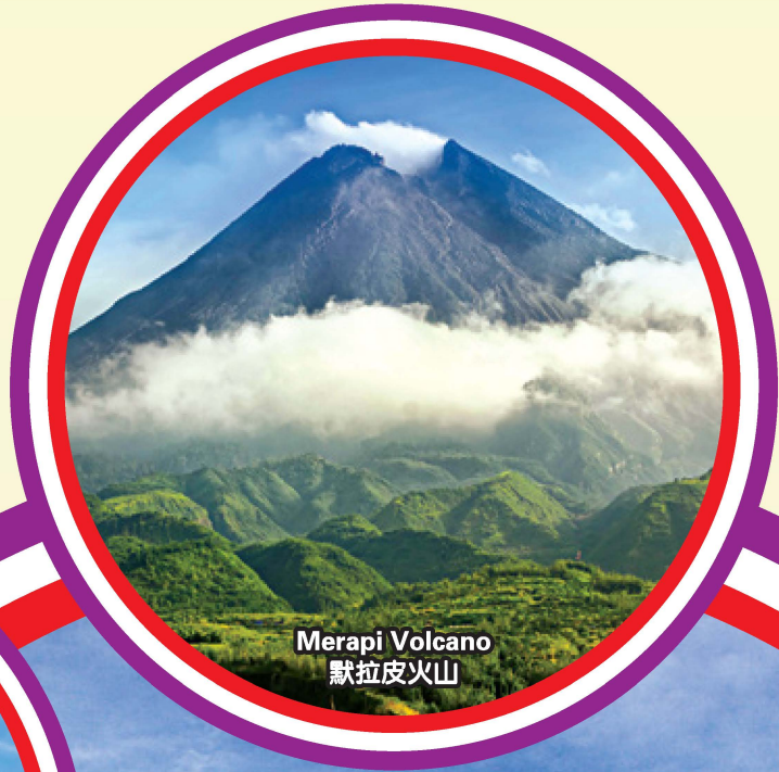
Merapi Volcano 默拉皮火山