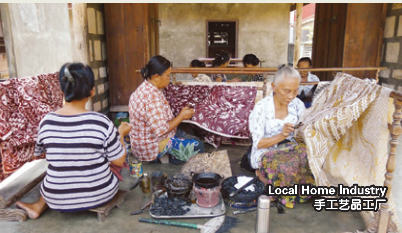
Local Home Industry 手工艺品工厂