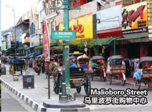
Malioboro Street 马里波罗街购物中心