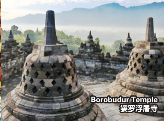
Borobudur Temple 婆罗浮屠寺