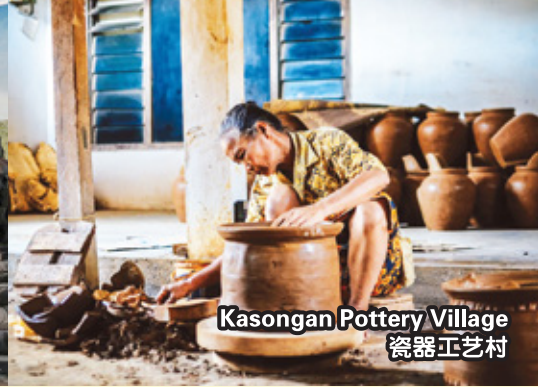
Kasongan Pottery Village 瓷器工艺村