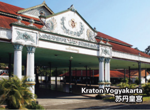
Kraton Yogyakarta 苏丹皇宫