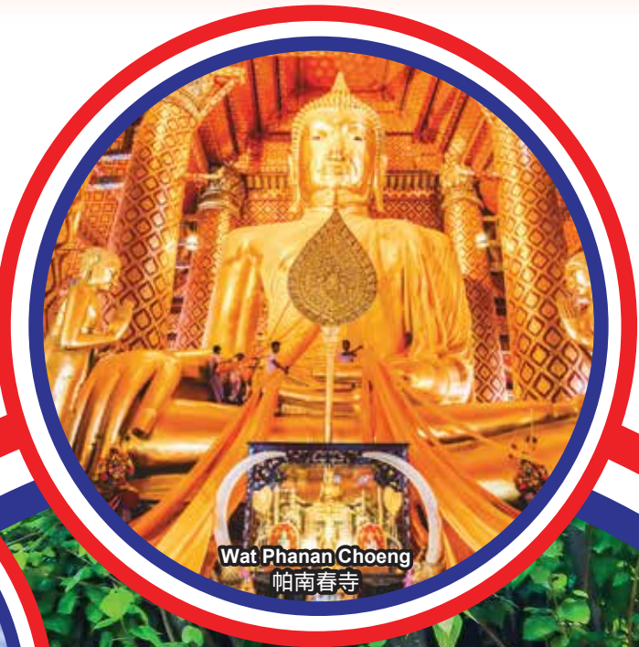
Wat Phanan Choeng 帕南春寺