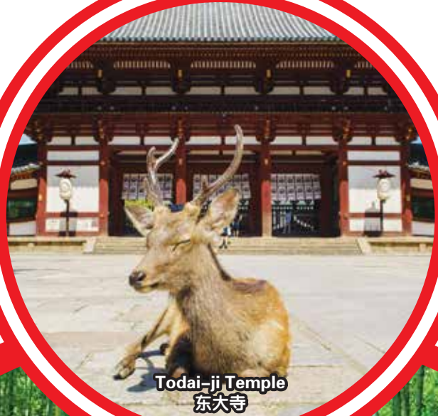
Todai-ji Temple 东大寺