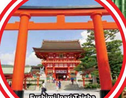
Fushimi Inari Taisha 稻荷神社

Sequences of Itinerary are subject to local arrangement. 行程次序, 以当地旅社安排为准。