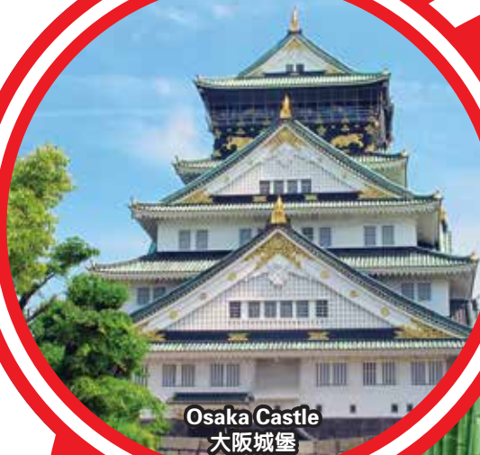
Osaka Castle 大阪城堡