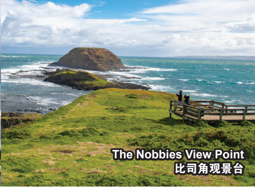
The Nobbies View Point 比司角观景台