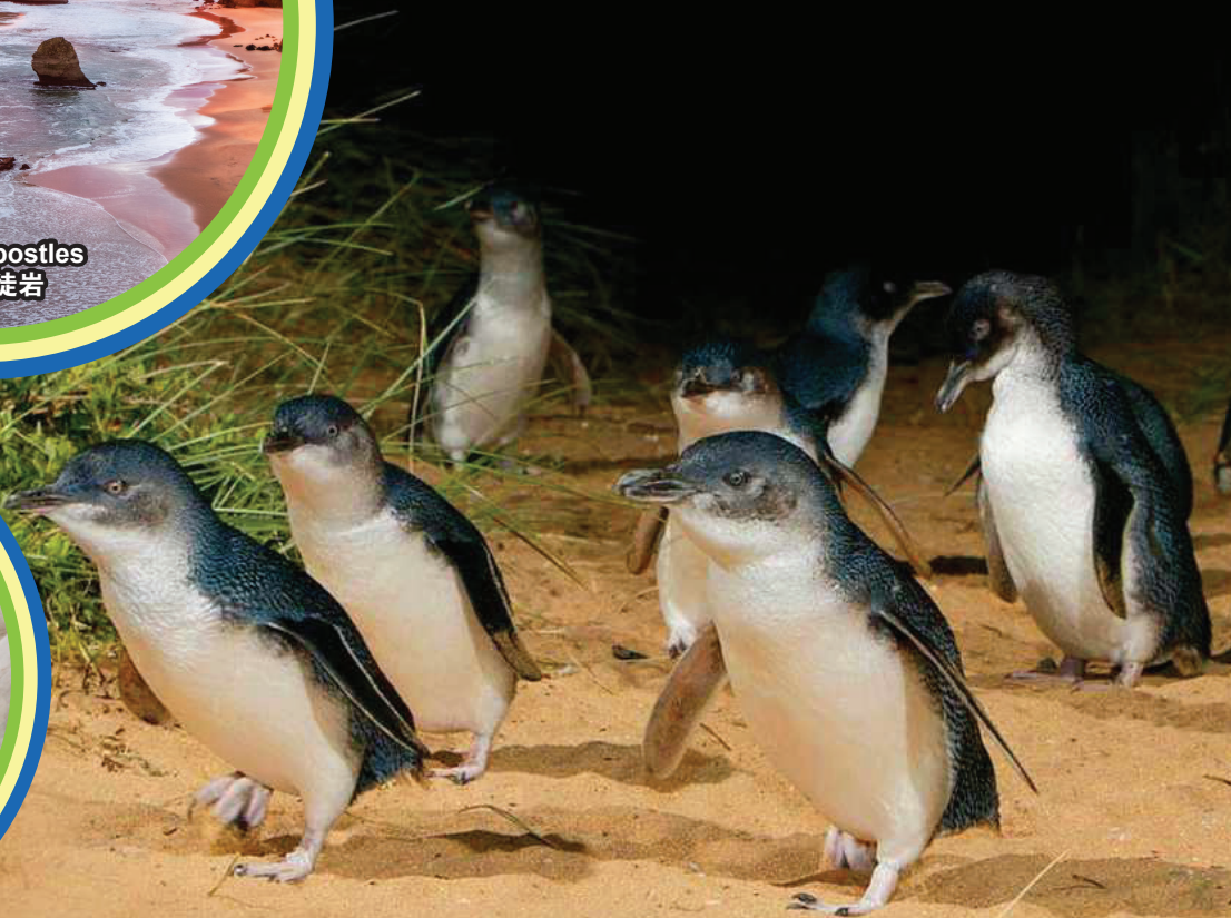
Penguin Parade 小企鹅自然生态保护区

行程次序，以当地旅社安排为准。 Sequences of Itinerary are subject to local arrangement.