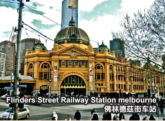
Flinders Street Railway Station Melbourne 佛林德兹街车站