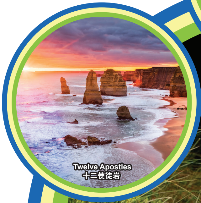
Twelve Apostles 十三使徒岩