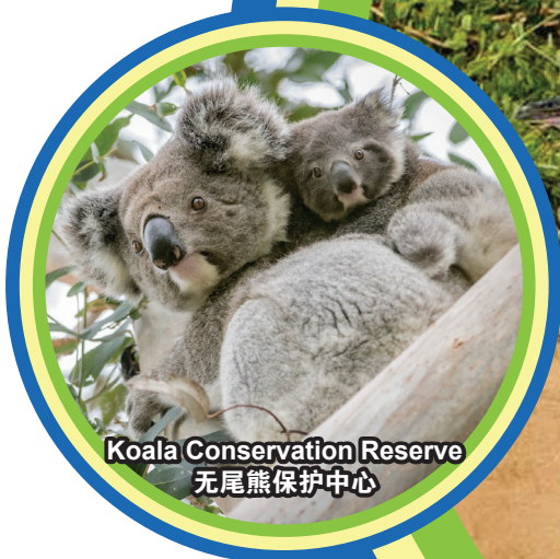
Koala Conservation Reserve 无尾熊保护中心