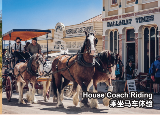
House Coach Riding 乘坐马车体验