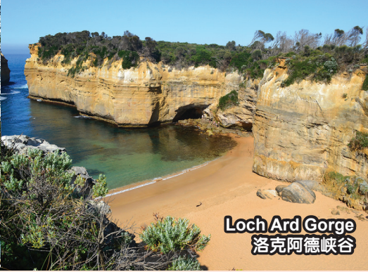
Loch Ard Gorge 洛克阿德峡谷