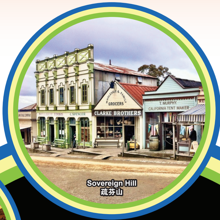
Sovereign Hill 疏芬山