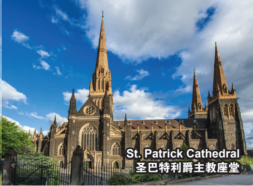
St. Patrick Cathedral 圣巴特利爵主教座堂