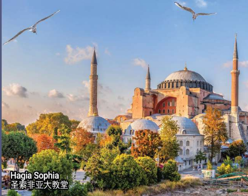
Hagia Sophia 圣索菲亚大教堂