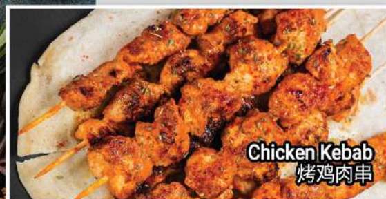
Chicken Kebab 烤鸡肉串