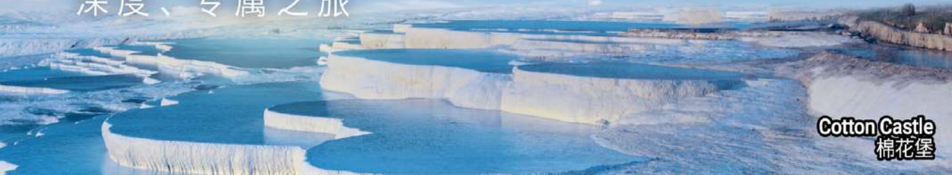
Cotton Castle 棉花堡