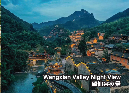
Wangxian Valley Night View 望仙谷夜景