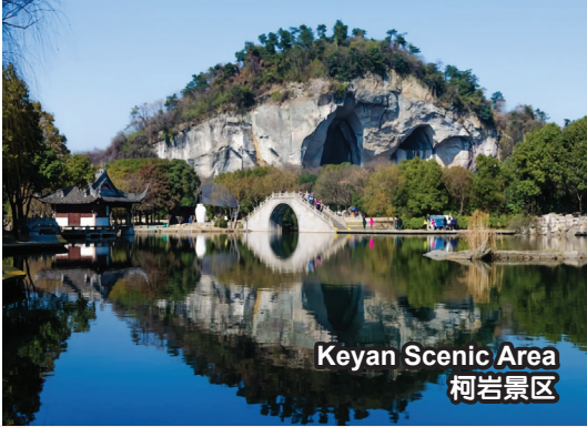
Keyan Scenic Area 柯岩景区