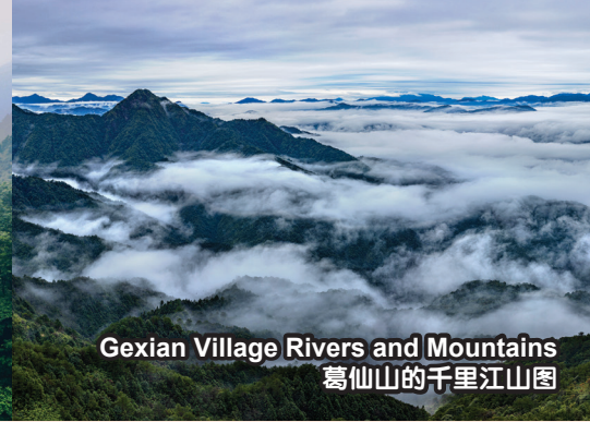
Gexian Village Rivers and Mountains 葛仙山的千里江山图