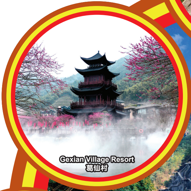
Gexian Village Resort 葛仙村