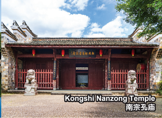
Kongshi Nanzong Temple 南宗孔庙