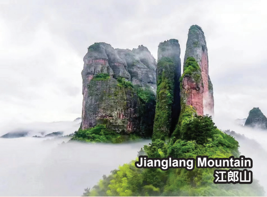
Jianglang Mountain 江郎山