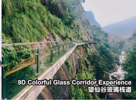
9D Colorful Glass Corridor Experience 望仙谷玻璃栈道