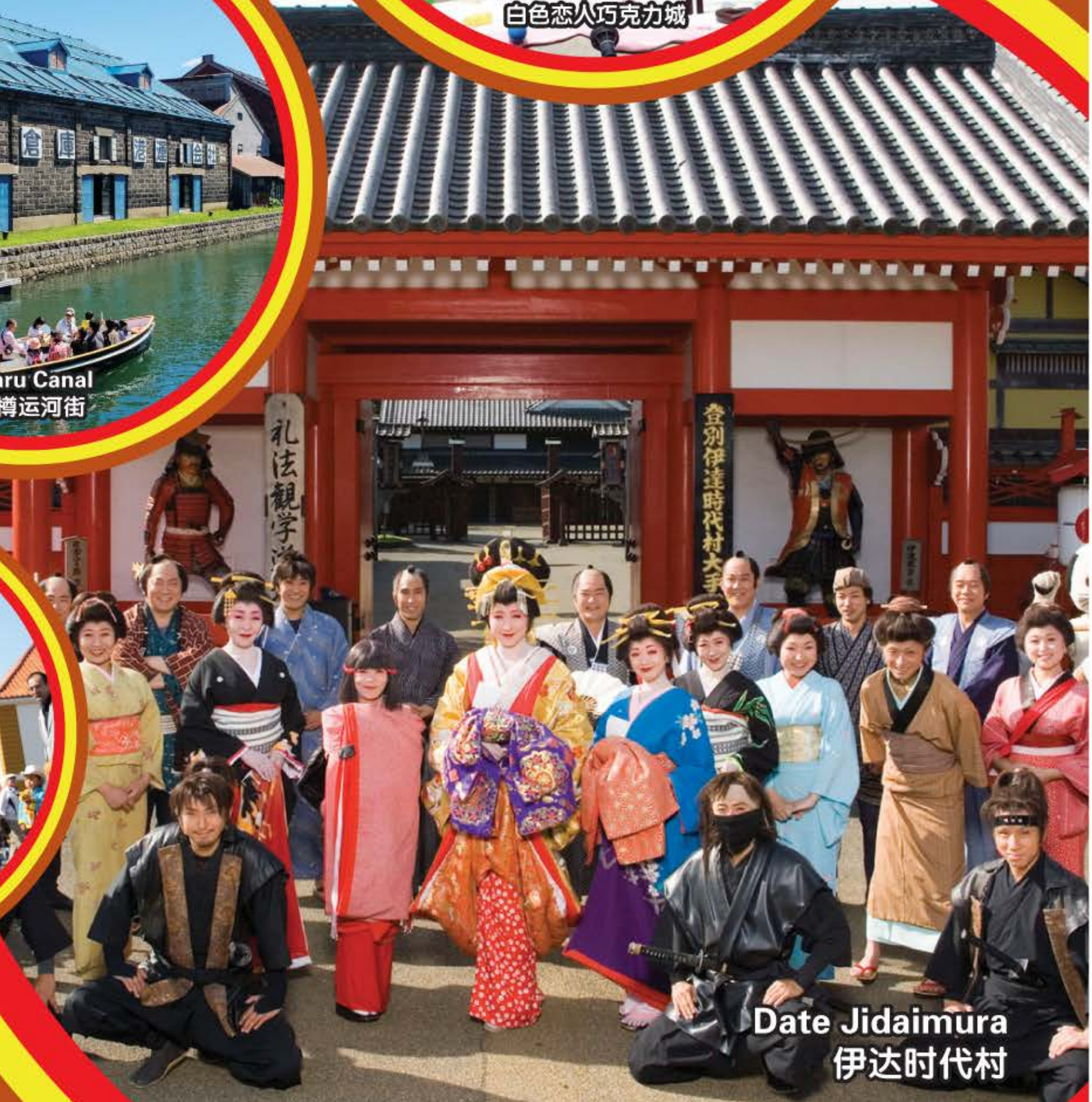
Date Jidaimura 伊达时代村

行程次序·以当地旅社安排为准。 Sequences of Itinerary are subject to local arrangement.