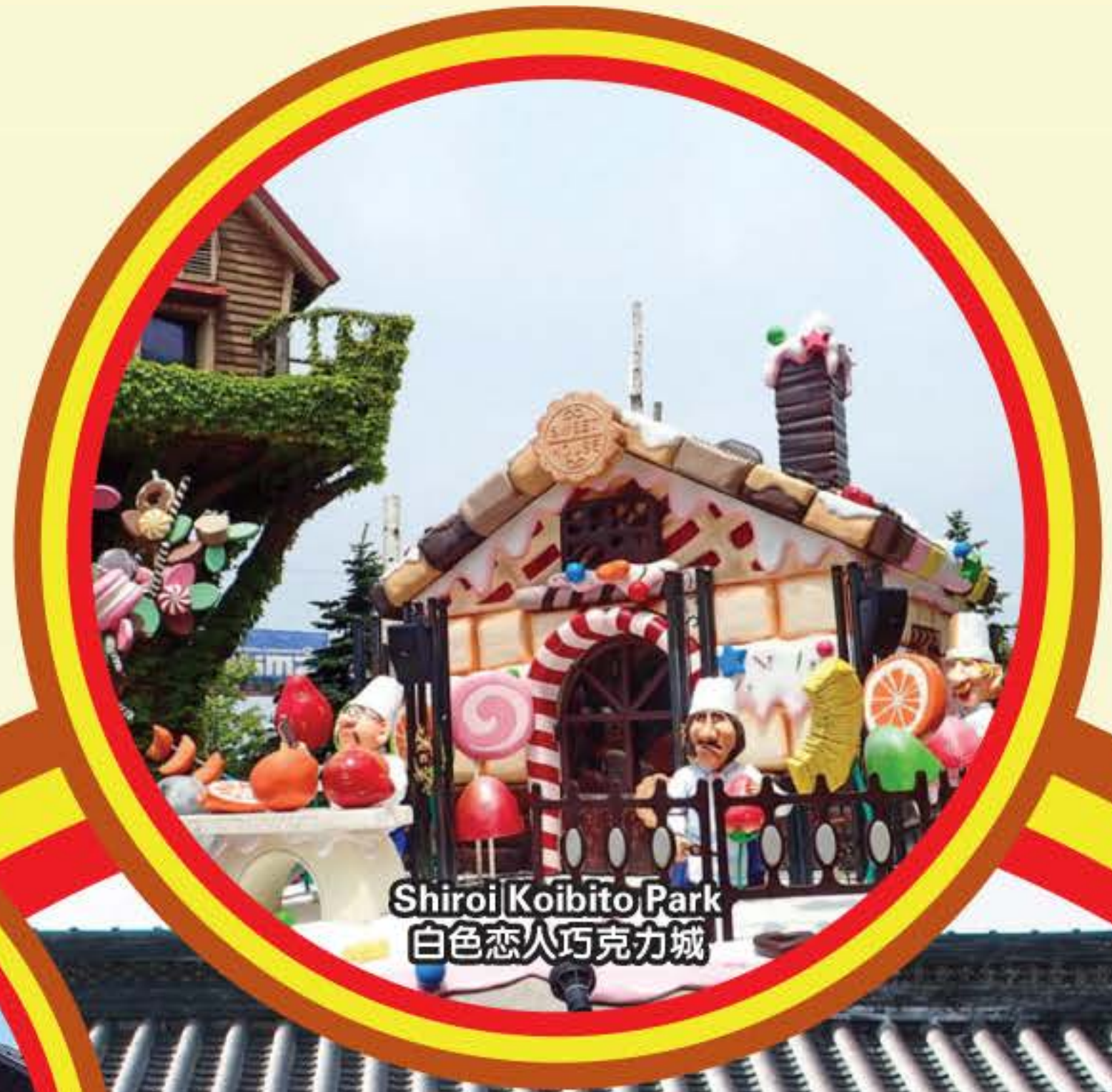
Shiroyo Koibito Park 白色恋人巧克力城