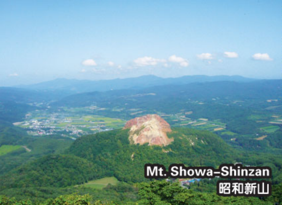
Mt. Showa-Shinzan 昭和新山