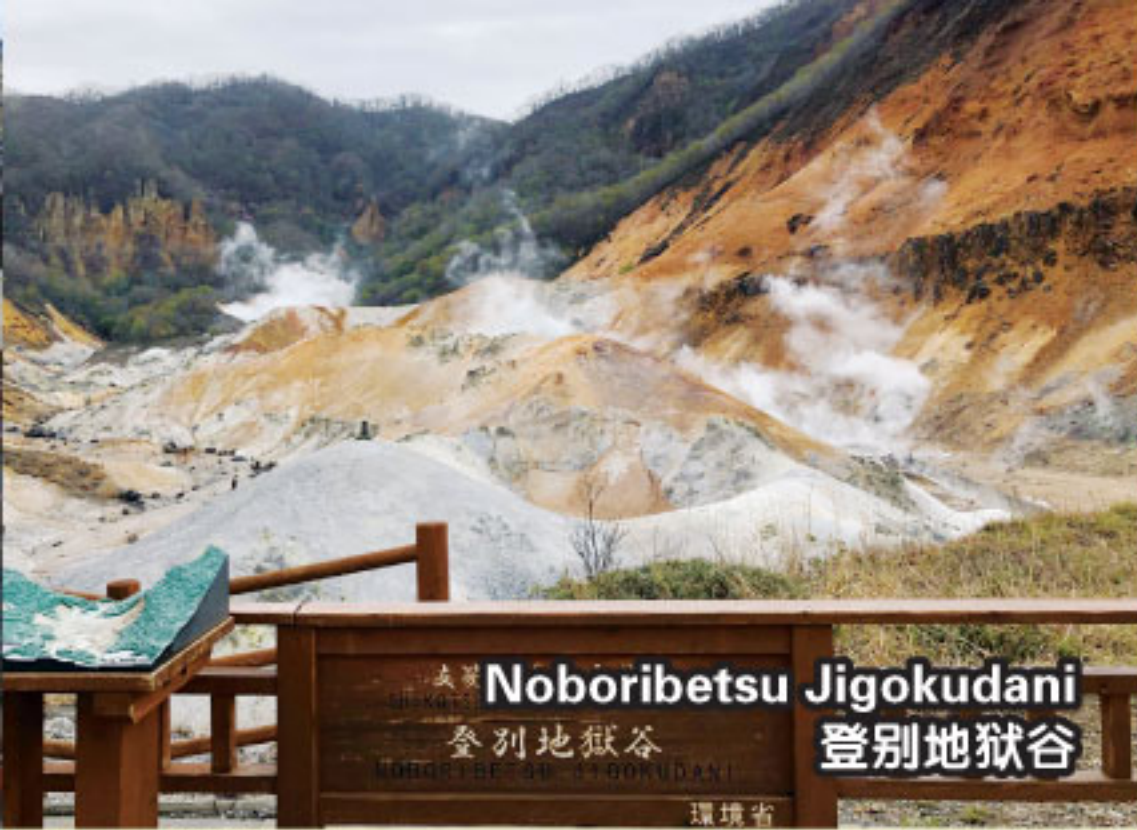
Noboribetsu Jigokudani 登別地獄谷