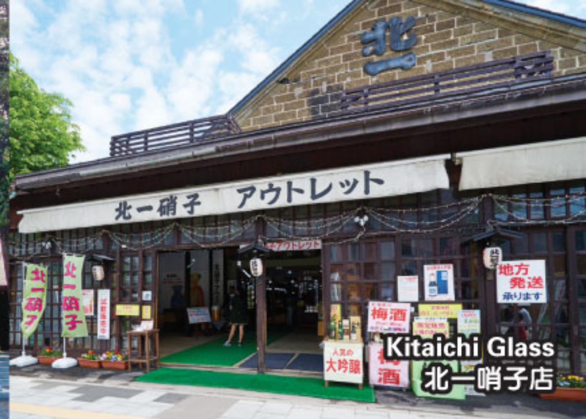
Kitaichi Glass 北一硝子店