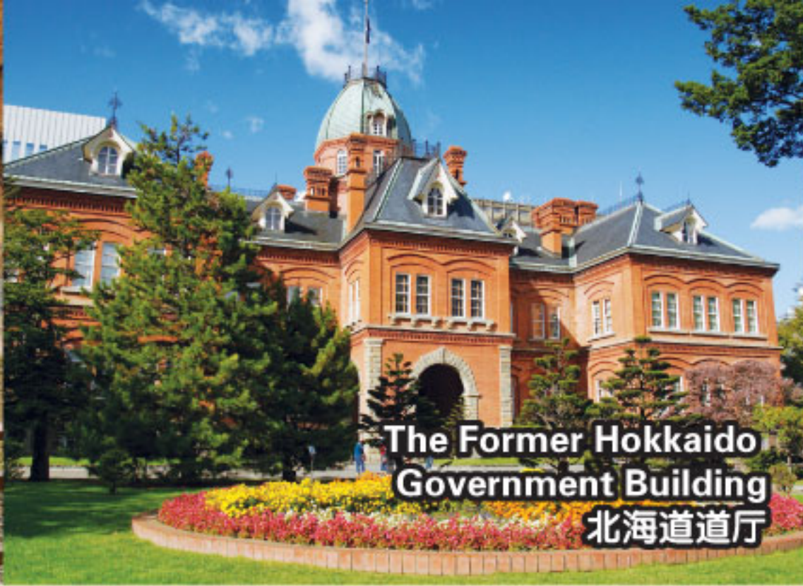
The Former Hokkaido Government Building 北海道道庁