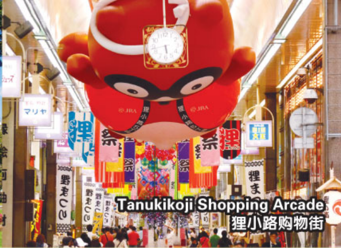
Tanukikoji Shopping Arcade 狸小路购物街