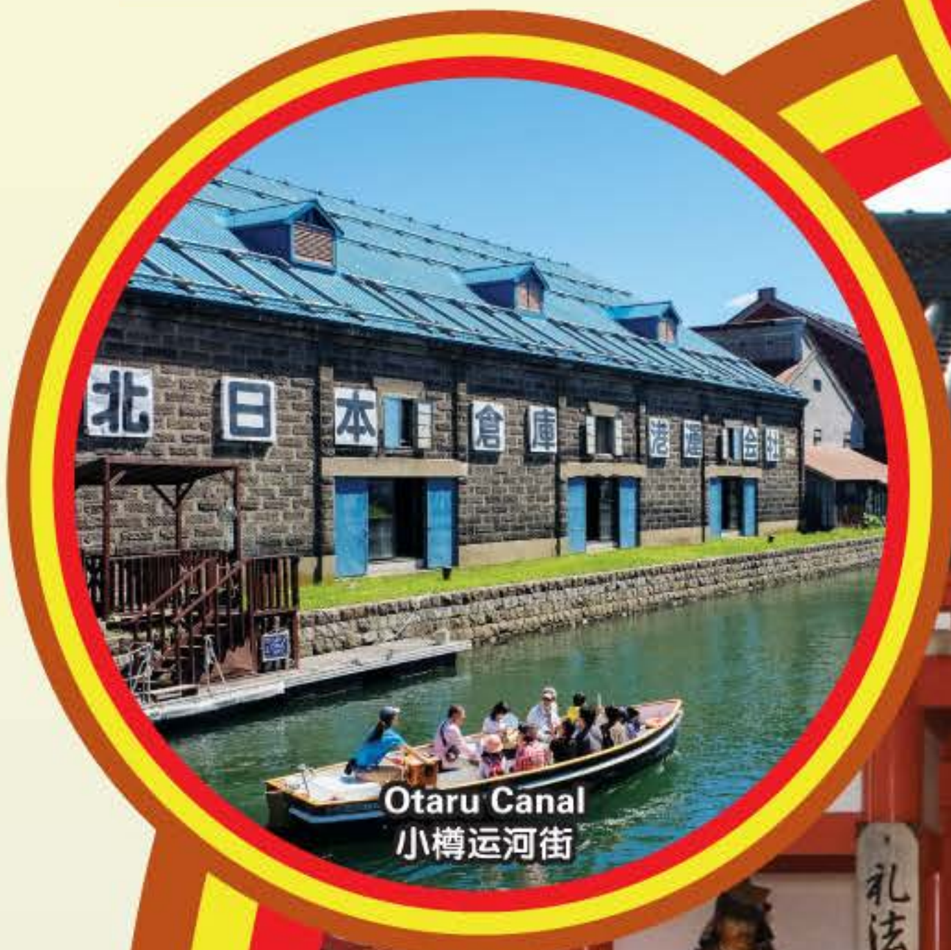
Otaru Canal 小樽运河街