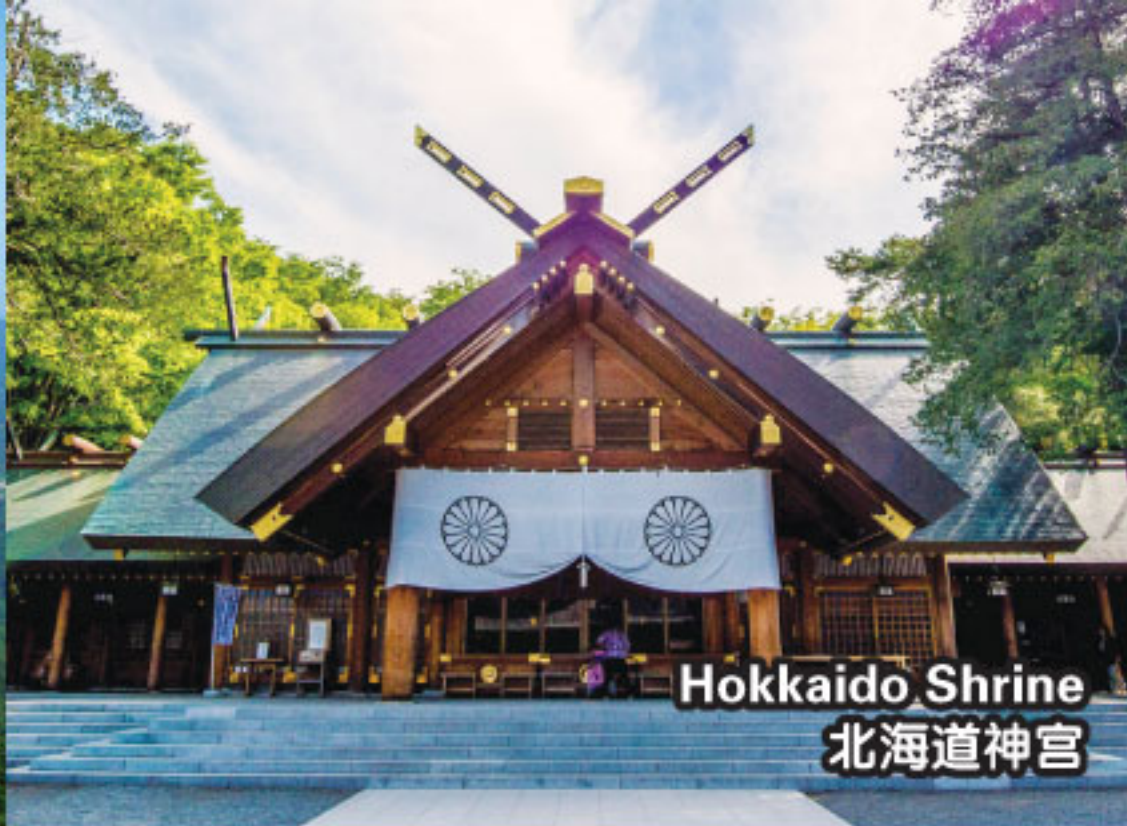
Hokkaido Shrine 北海道神宮