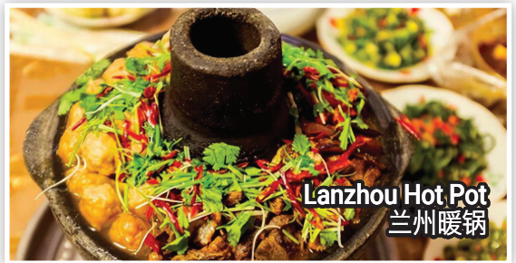
Lanzhou Hot Pot 兰州暖锅