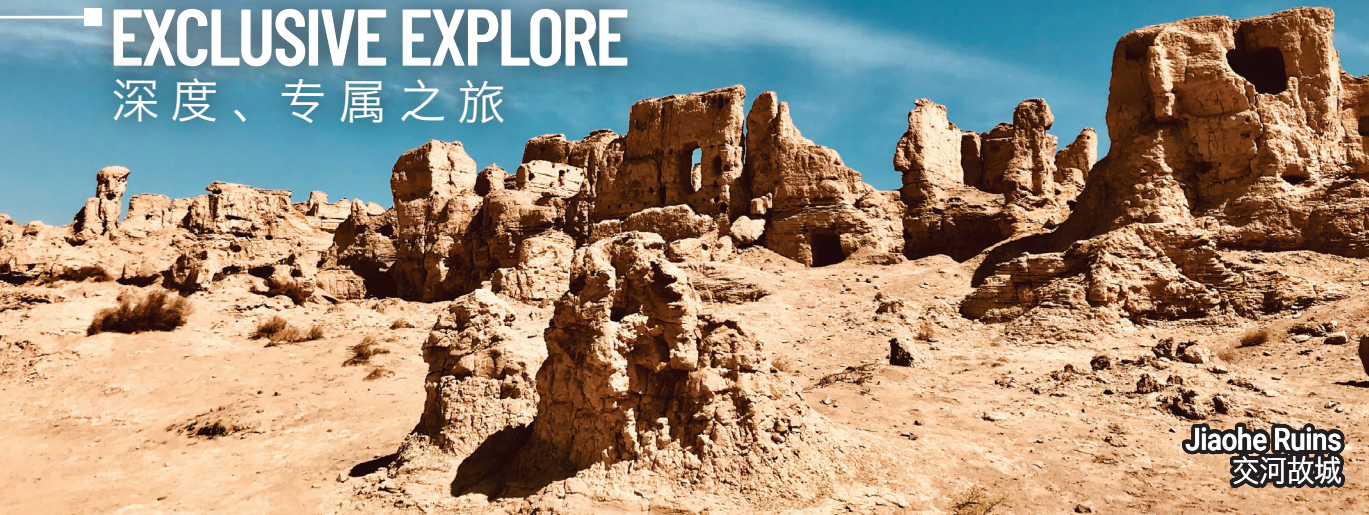
Jiaohe Ruins 交河故城