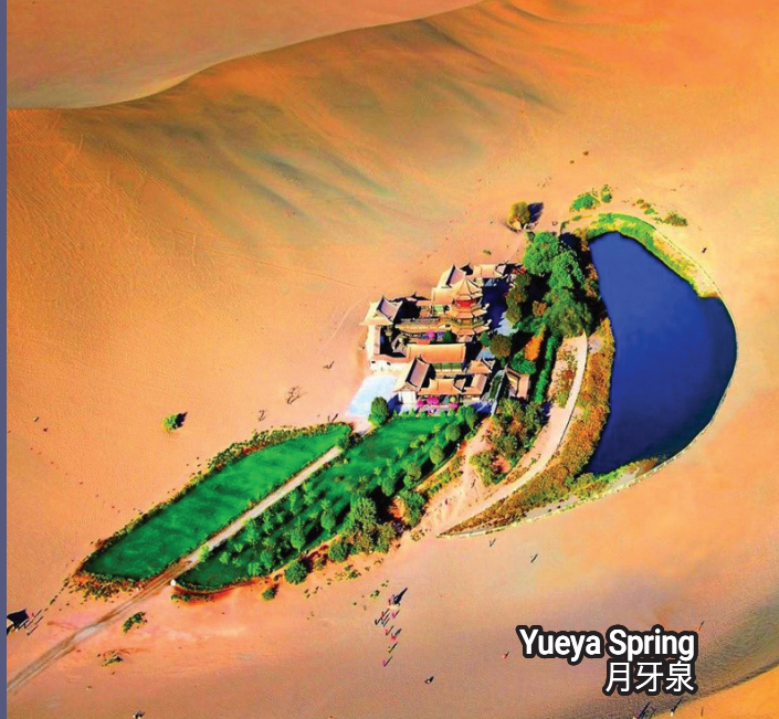
Yueya Spring 月牙泉