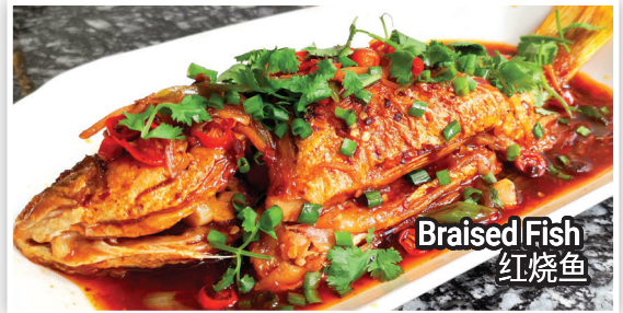
Braised Fish 红烧鱼