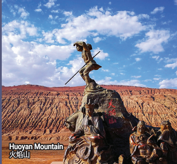
Huoyan Mountain 火焰山