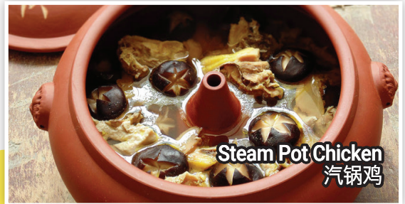
Steam Pot Chicken 汽锅鸡