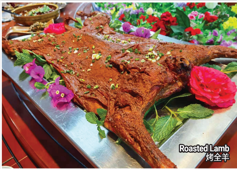
Roasted Lamb 烤全羊