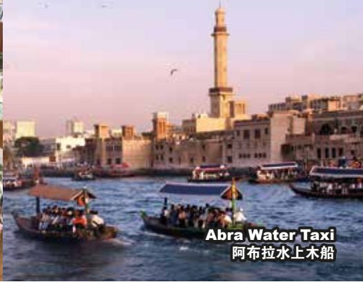
Abra Water Taxi 阿布拉克水上木船