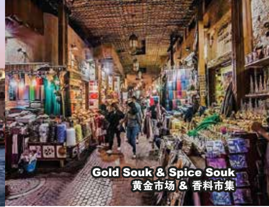
Gold Souk & Spice Souk 黄金市场 & 香料市集