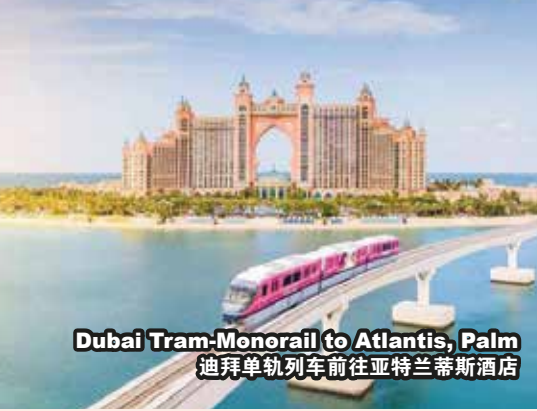
Dubai Tram-Monorail to Atlantis, Palm 迪拜单轨列车前往亚特兰蒂斯酒店