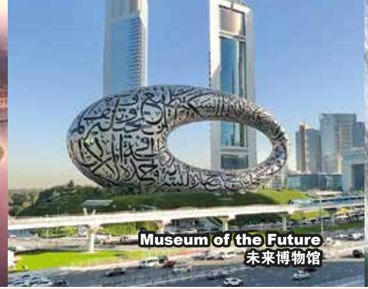
Museum of the Future 未来博物馆