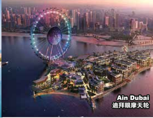
Ain Dubai 迪拜摩天轮