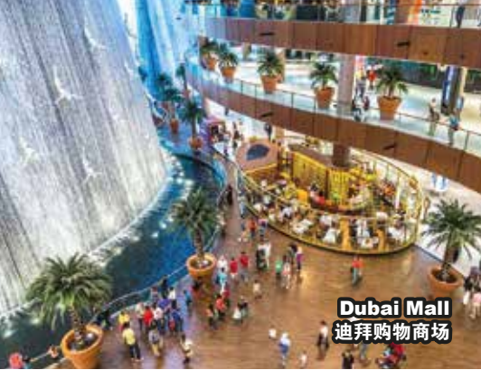
Dubai Mall 迪拜购物商场