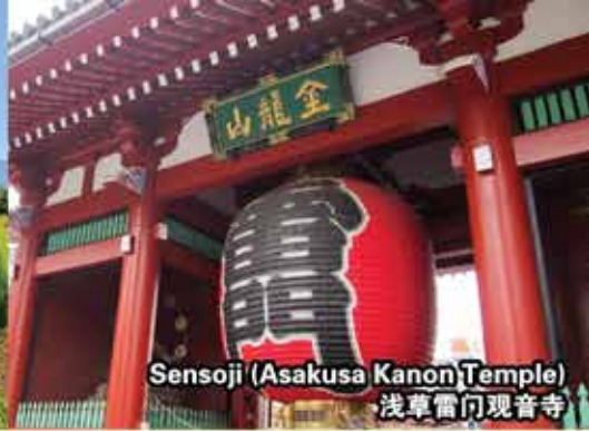
Sensoji (Asakusa Kannon Temple) 浅草雷门观音寺