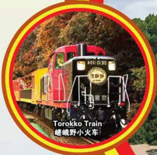
Torokko Train 嵯峨野小火车