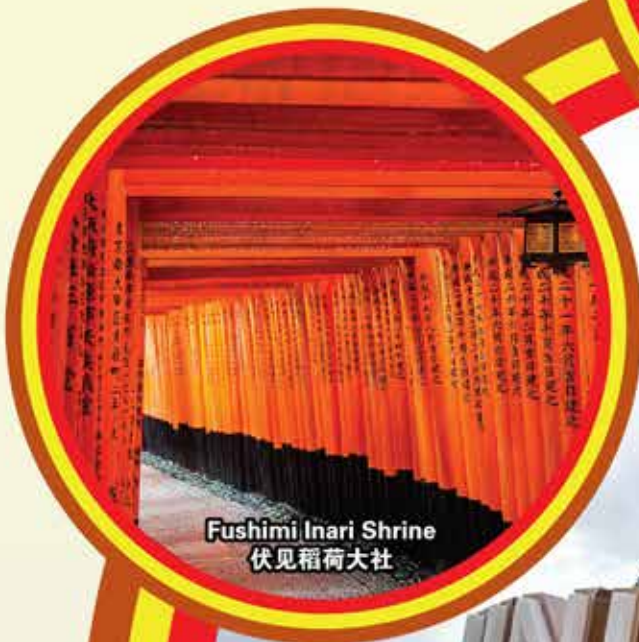
Fushimi Inari Shrine 伏见稻荷大社