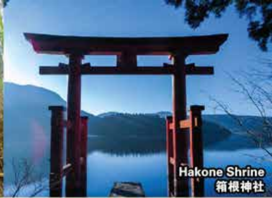
Hakone Shrine 箱根神社