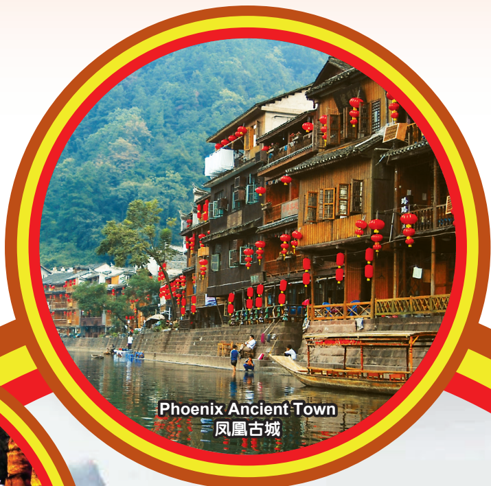
Phoenix Ancient Town 凤凰古城