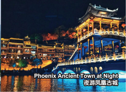
Phoenix Ancient Town at Night 夜游凤凰古城