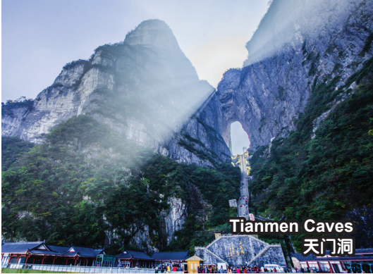
Tianmen Caves 天门洞