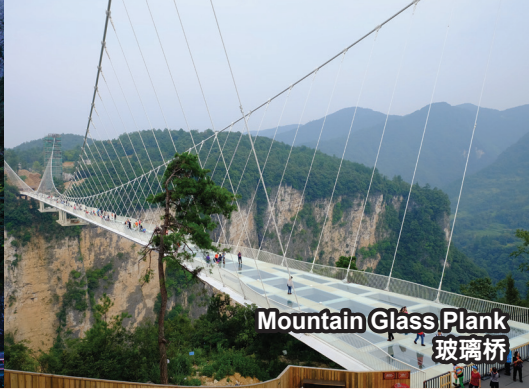
Mountain Glass Plank 玻璃桥