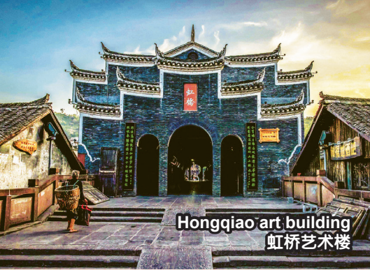
Hongqiao art building 虹桥艺术楼