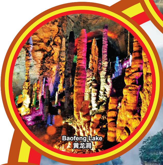
Baofeng Lake 黄龙洞