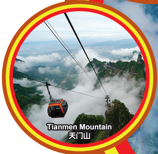
Tianmen Mountain 天门山