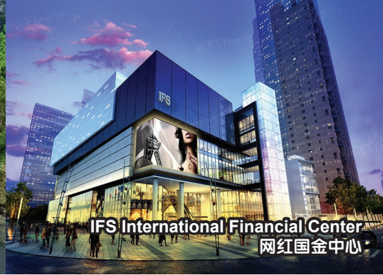
IFS International Financial Center 网红国金中心