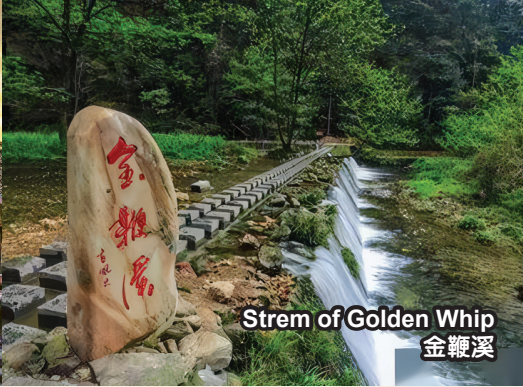
Strem of Golden Whip 金鞭溪